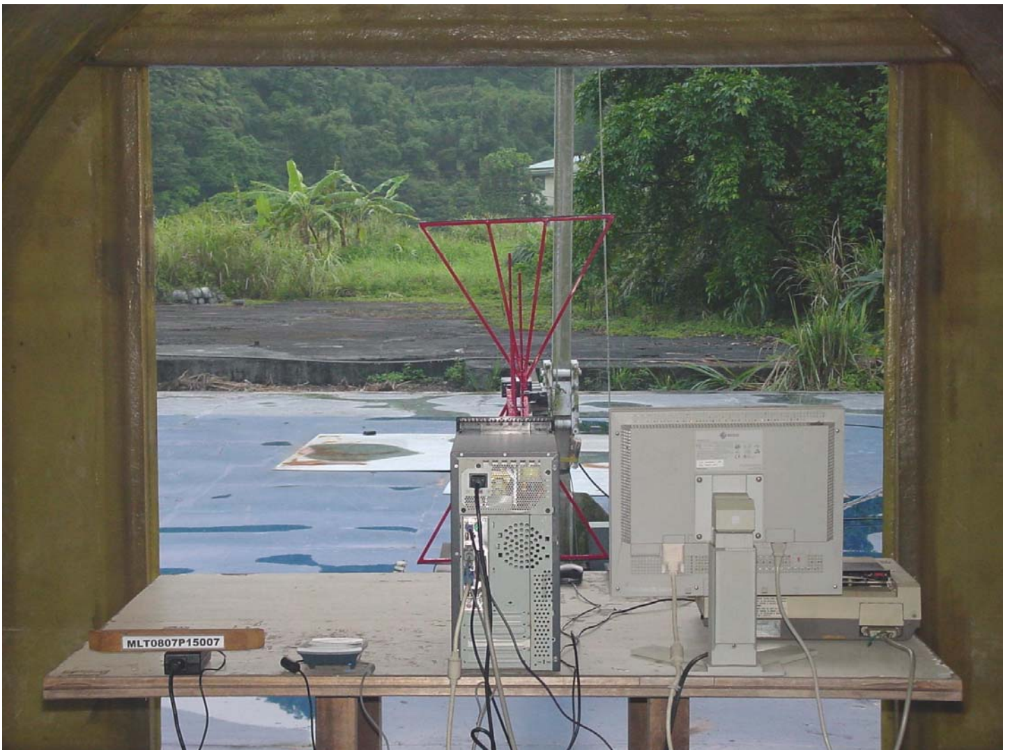
Rear View of The Test Configuration