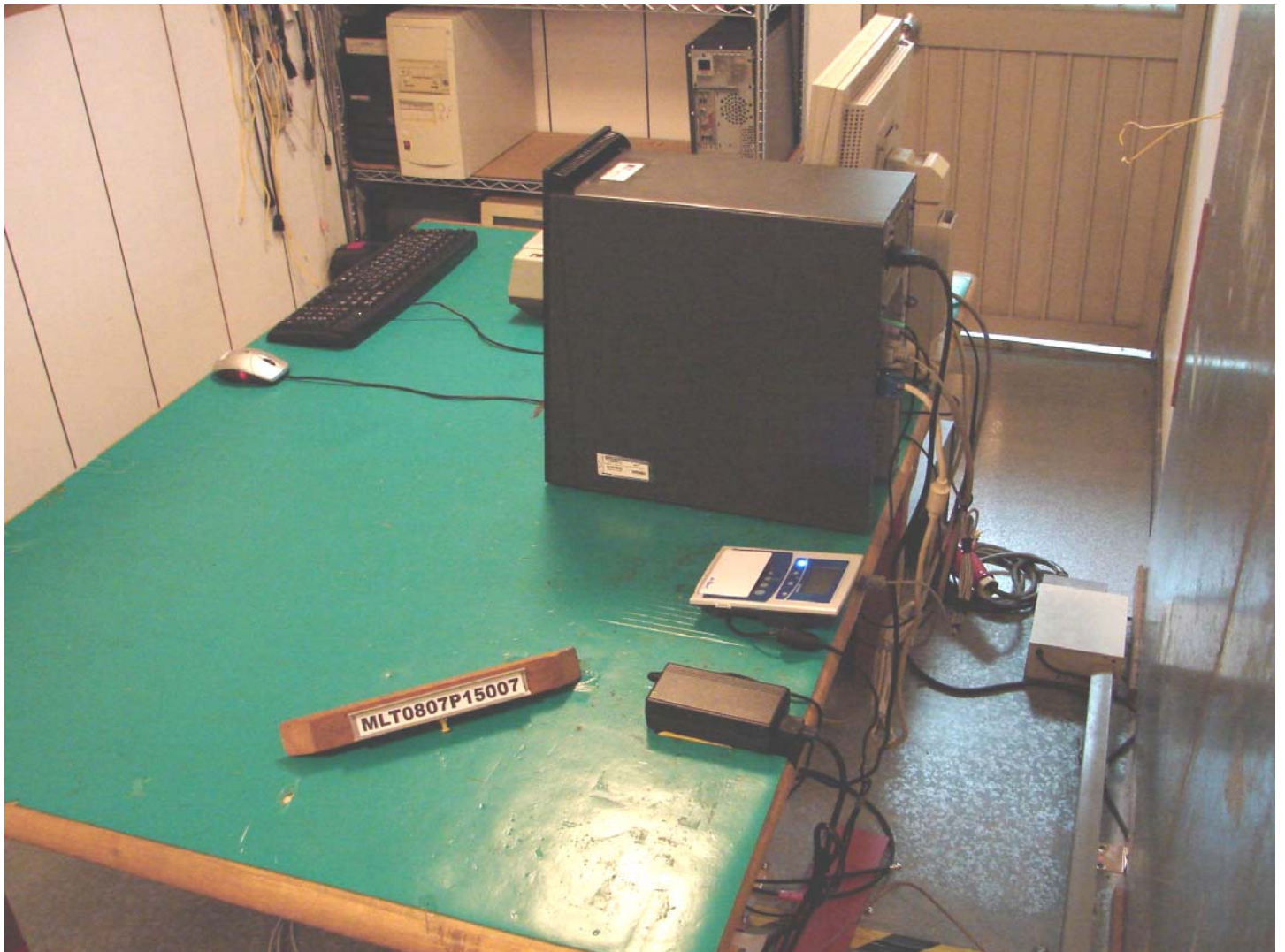
Rear View of The Test Configuration