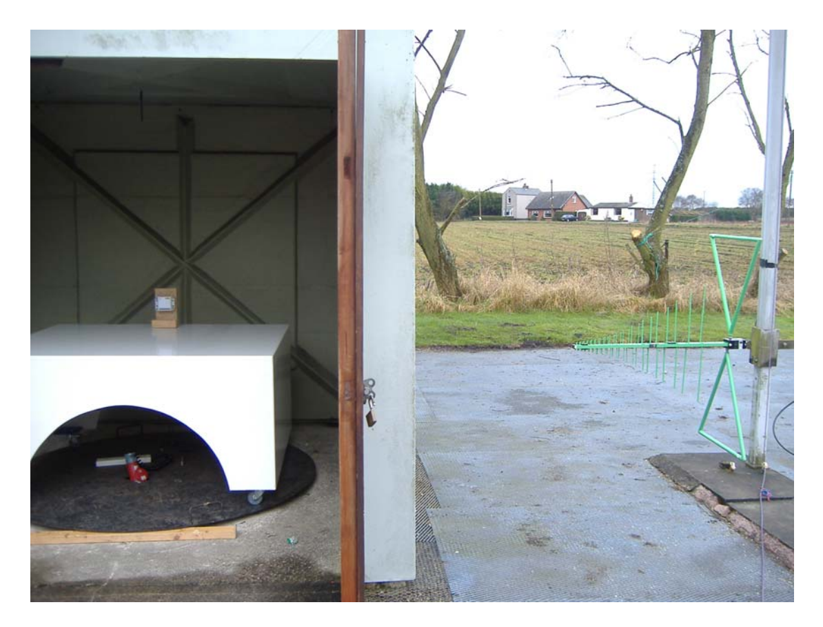
EUT On Range