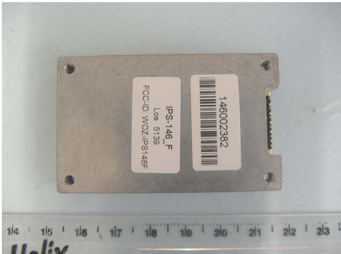
RF Module Rear Side