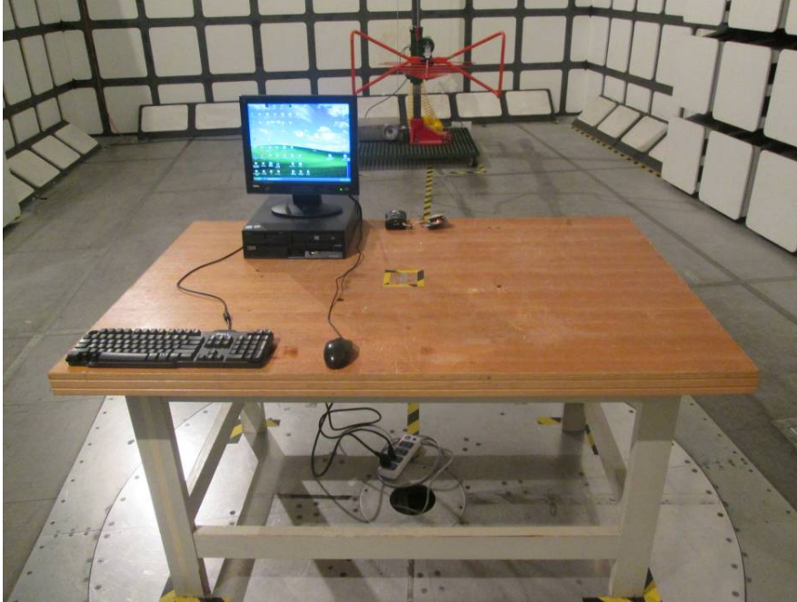
Radiated Emissions – Rear View (30-1000 MHz)