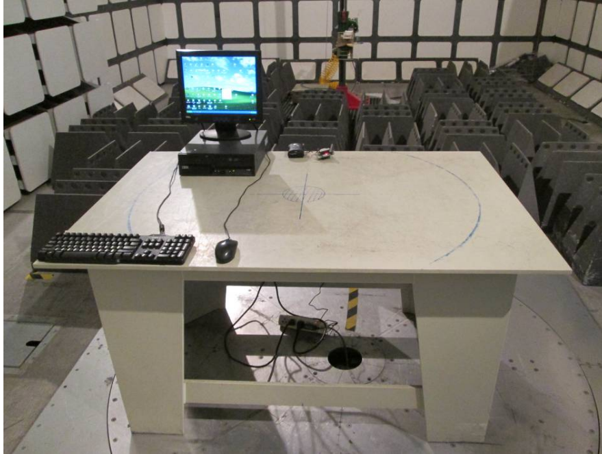
Radiated Emissions – Rear View (1-25 GHz)