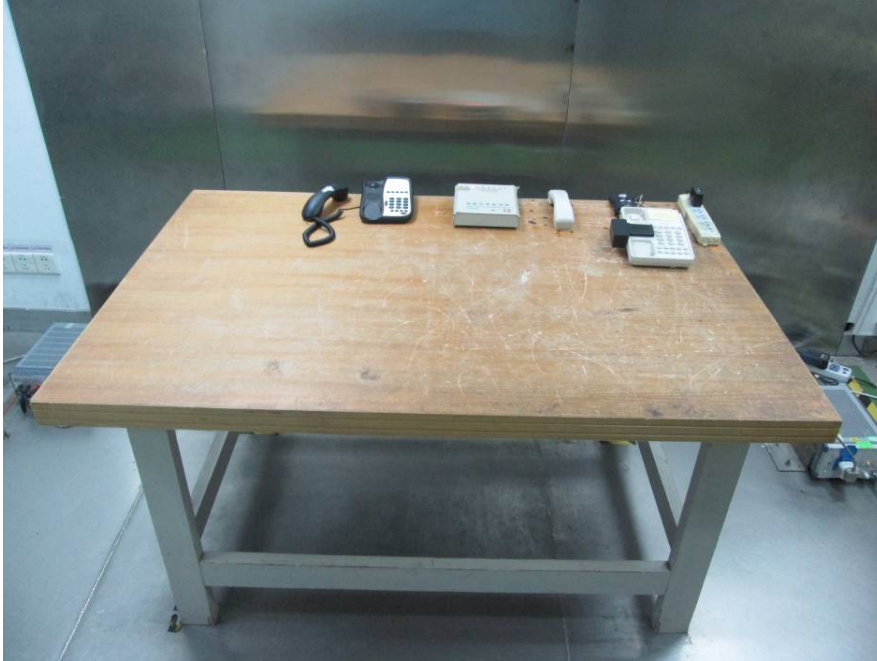
Conducted Emissions - Side View