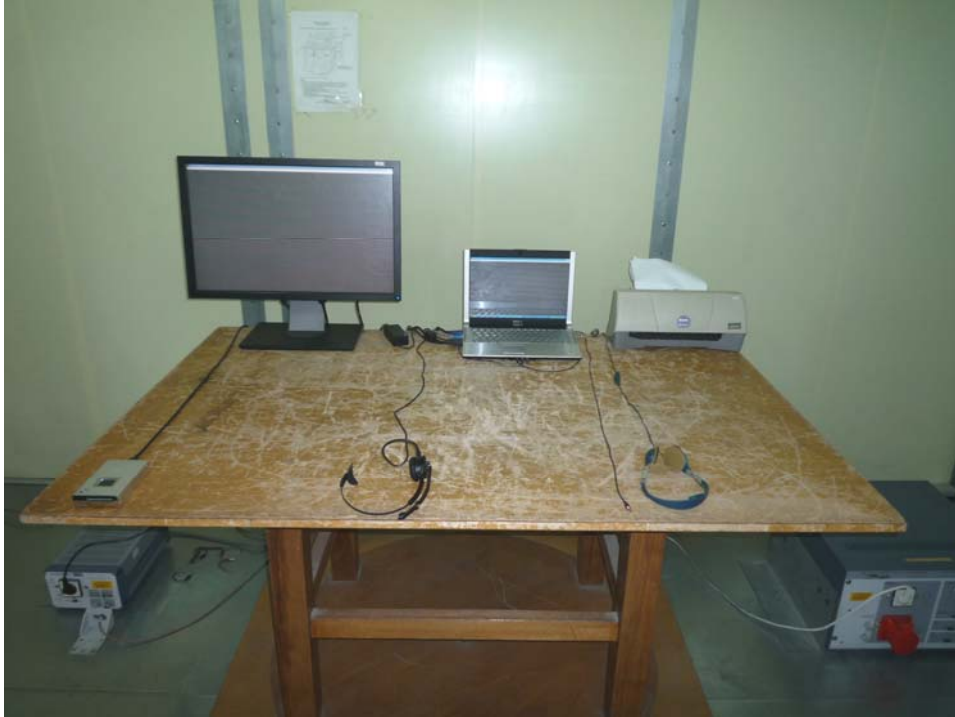
Power line conducted emission_ Rear