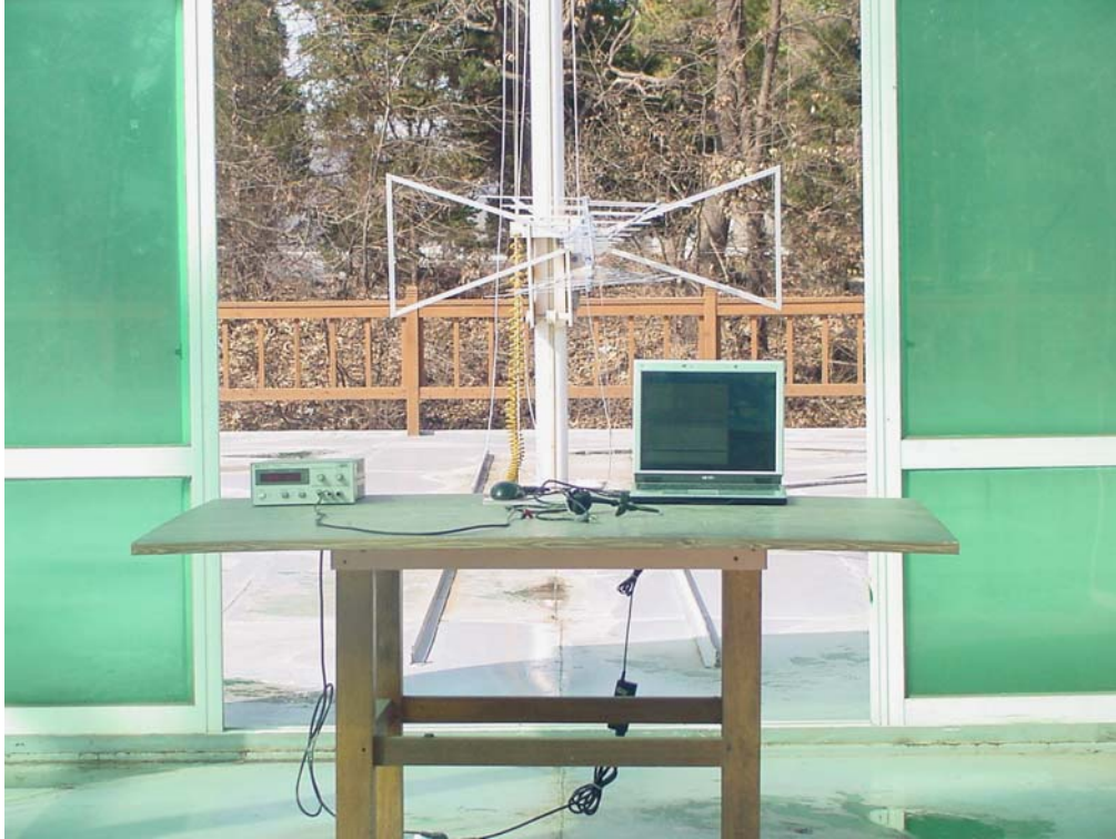
Radiated RF measurement (Above 1 GHz)