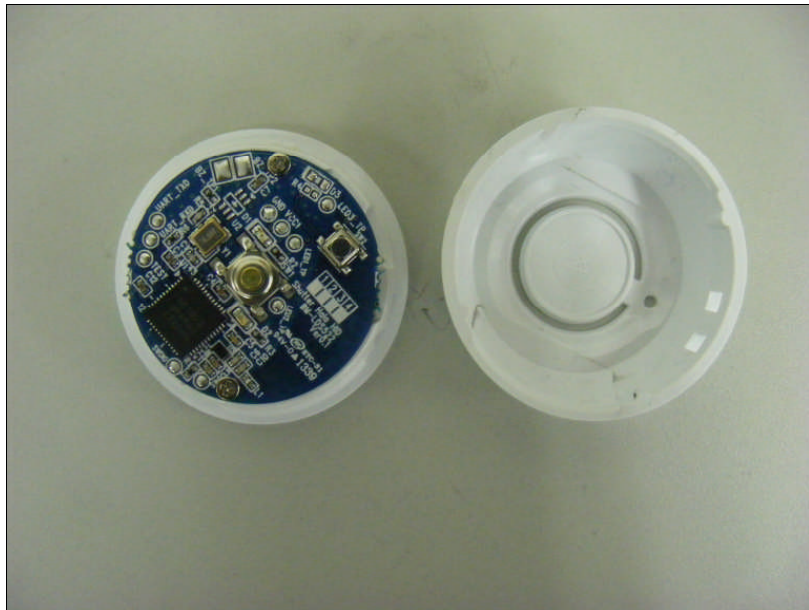
Top view of EUT