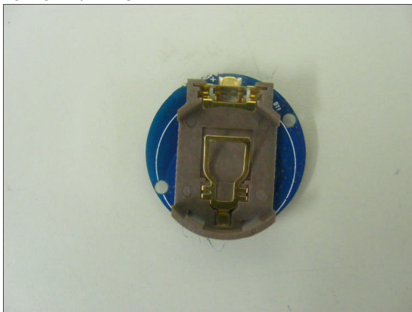
Bottom view of Main PCB