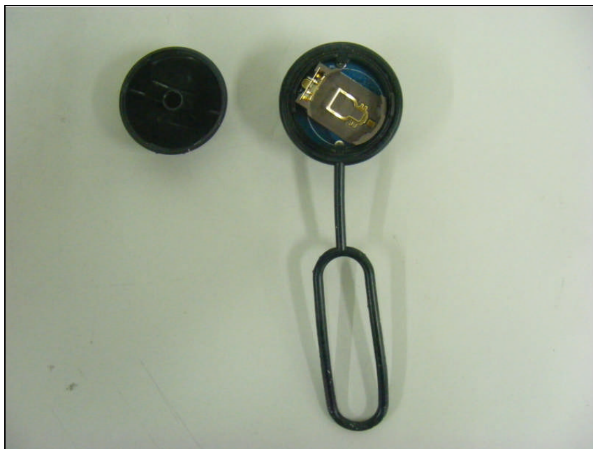
Top view of EUT