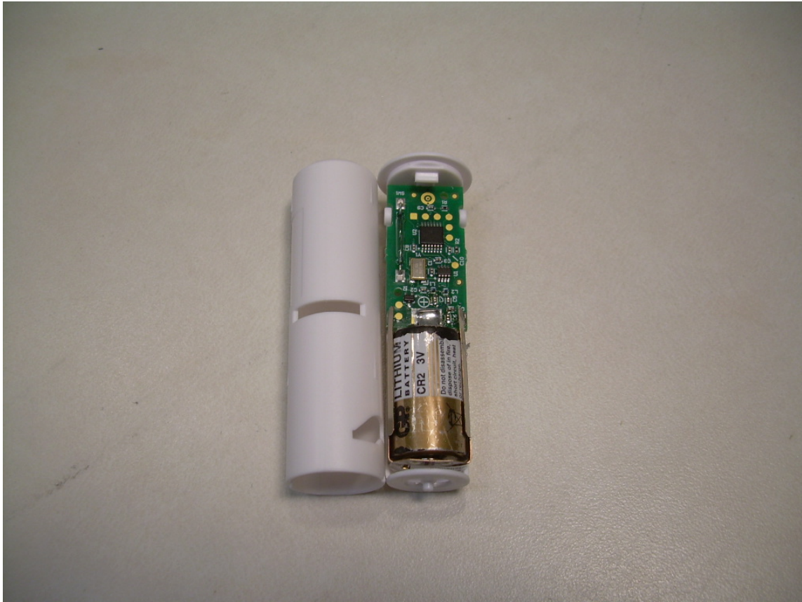
View of the EUT with the Cover Slid Off