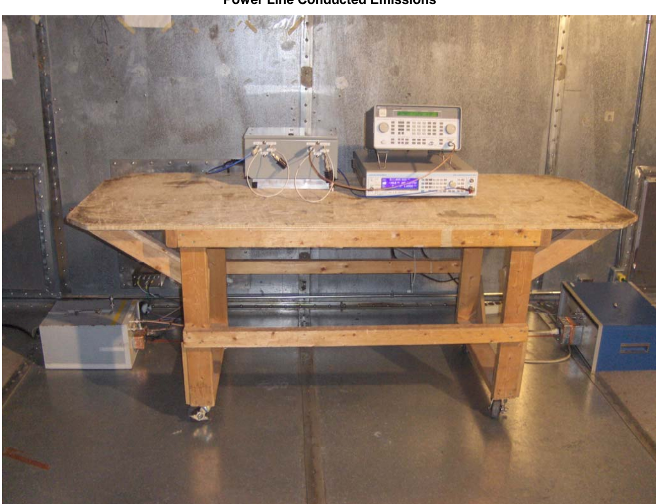
Power Line Conducted Emissions