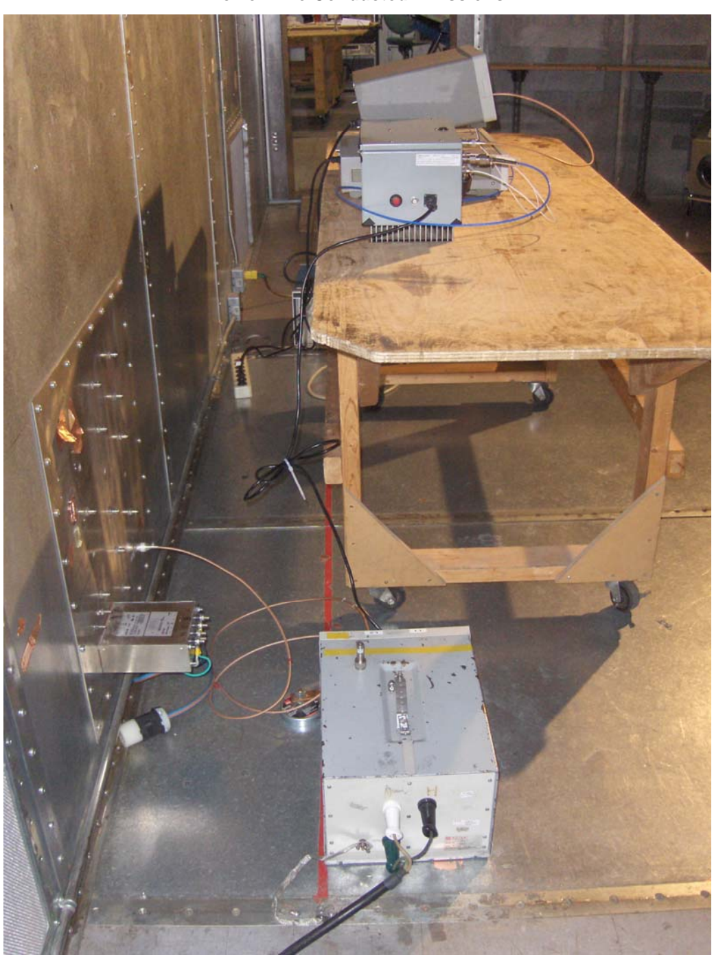
Power Line Conducted Emissions