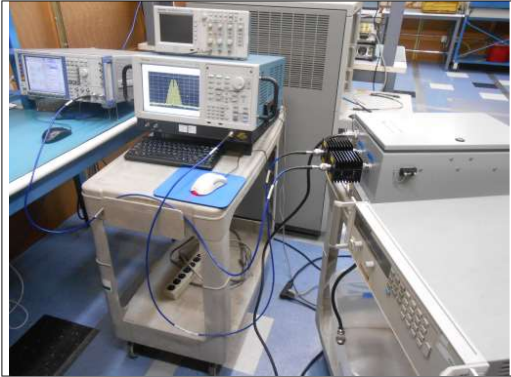
RF Conducted #2