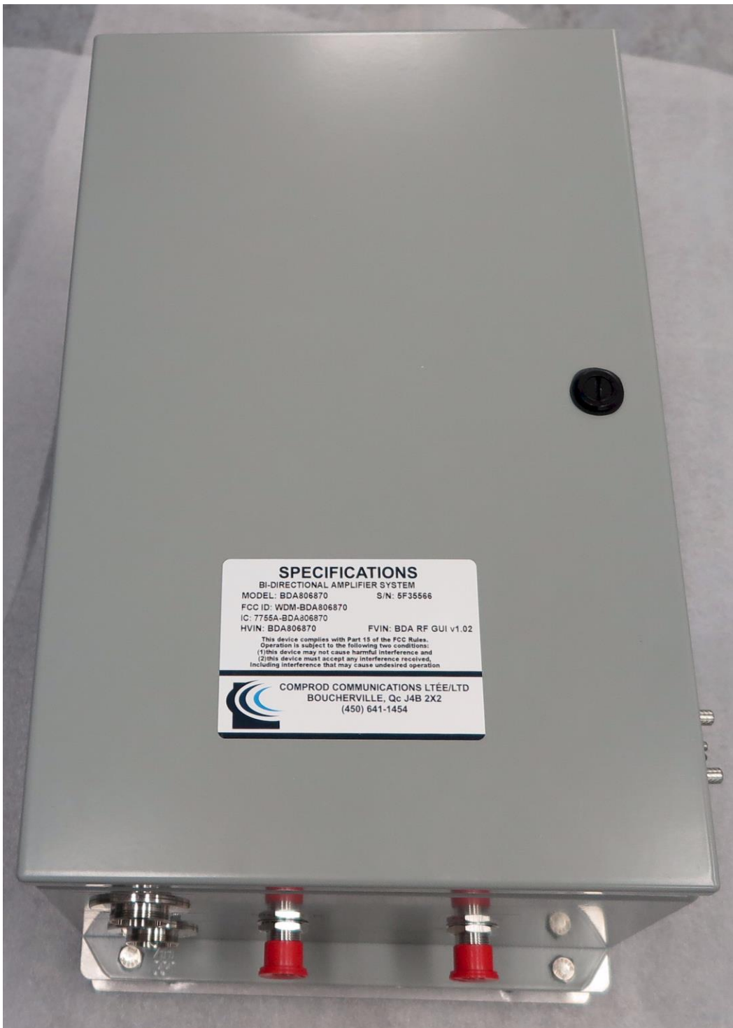
Figure 4: 800 MHz Bidirectional Amplifier