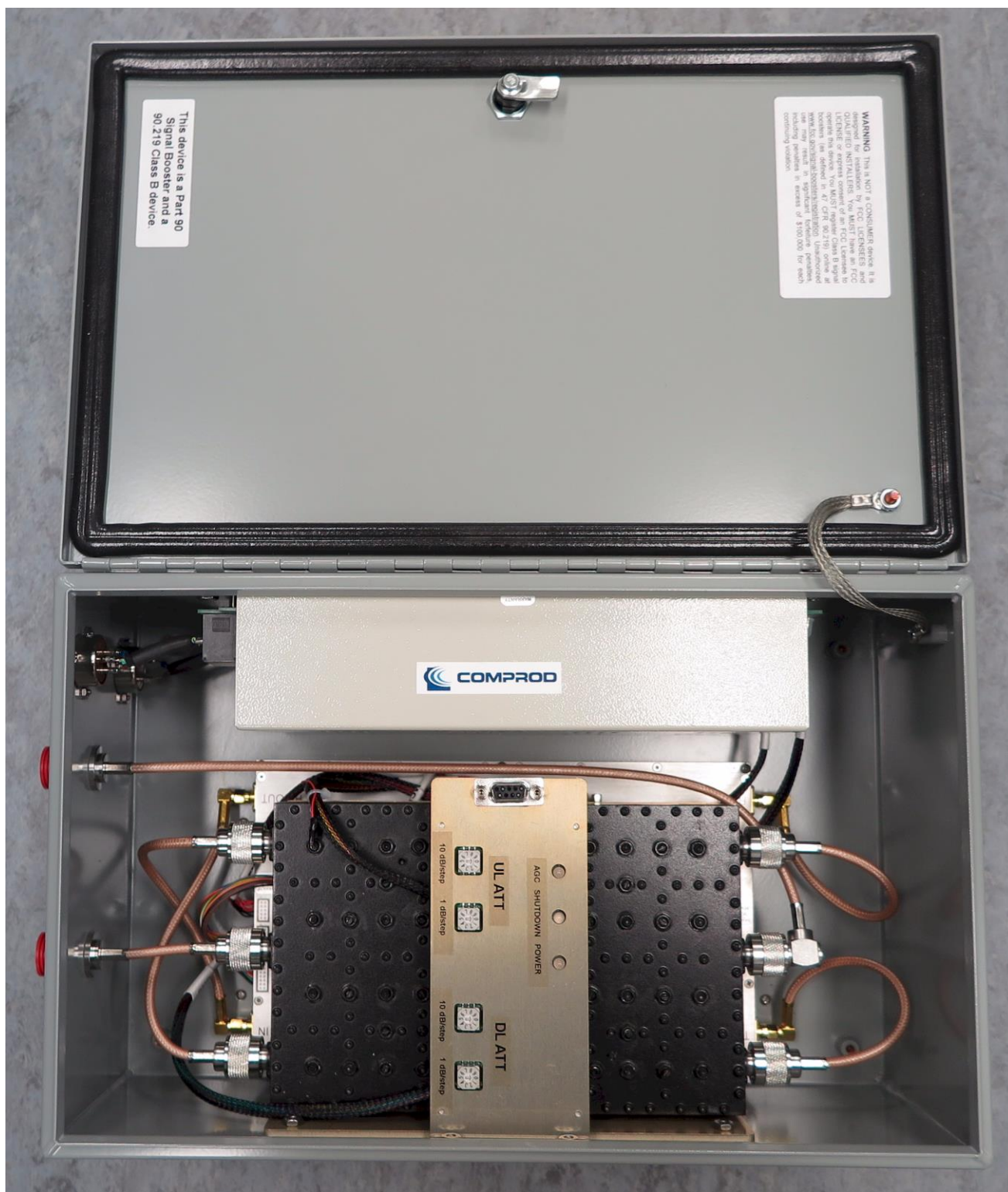
Figure 5: Label position on the BDA

The amplifier unit has its FCC/IC, Warning and Signal Booster Class B labels on the front cover, as shown in the above picture. These labels must not be removed.