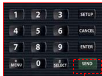
Send button to page pagers