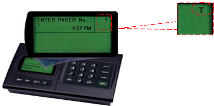
Transmit Indicator – page being sent using keypad or thru RS232 port. This also indicates the Out of Range signal is being sent.