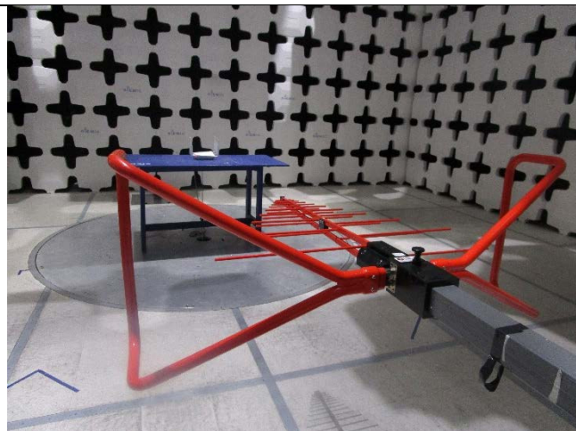
Radiated Emissions (<1GHz) – Front View