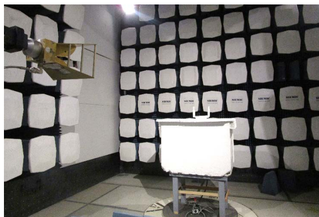
Radiated Emissions (>1GHz) – Front View