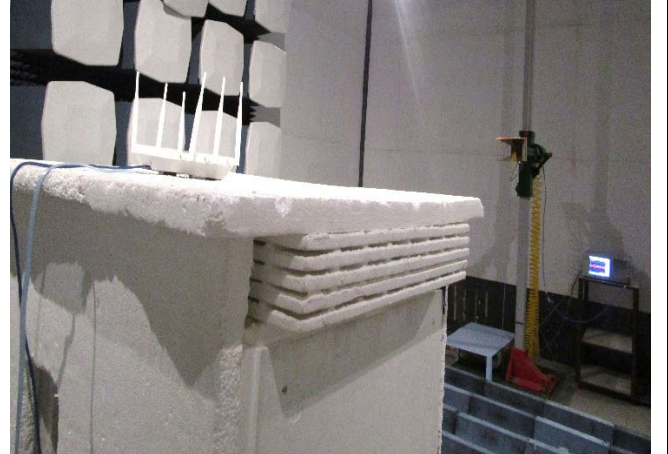
Radiated Emissions (>1GHz) – Rear View