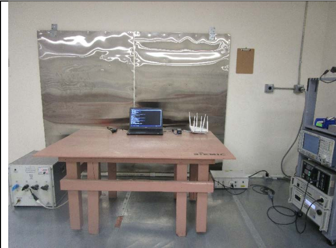
AC Line Conducted Emissions – Front View