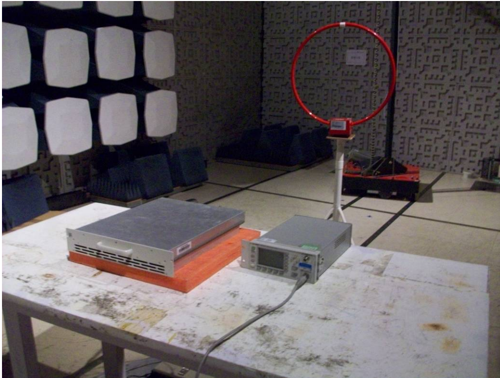
TEST SETUP OF RADIATED EMISSION (9kHz-30MHz)