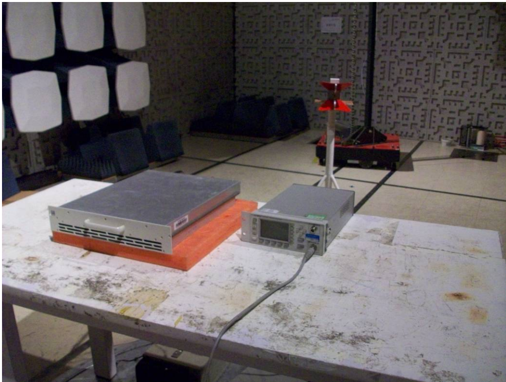
TEST SETUP OF RADIATED EMISSION (above 1GHz)