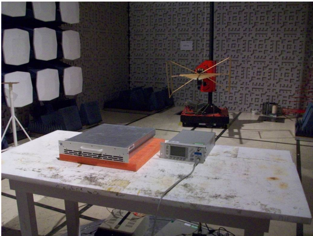
TEST SETUP OF RADIATED EMISSION (30MHz-1GHz)