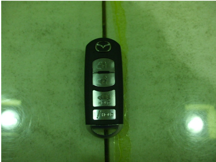
Mechanical Key (Inserted)