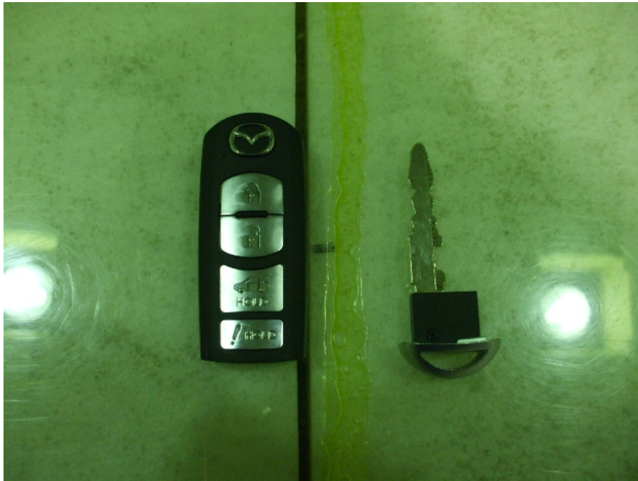
Mechanical Key (Not Inserted) Worst