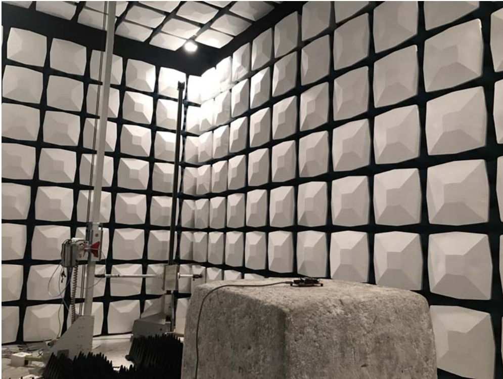
Description: Radiated Emission Test Setup for Above 18GHz