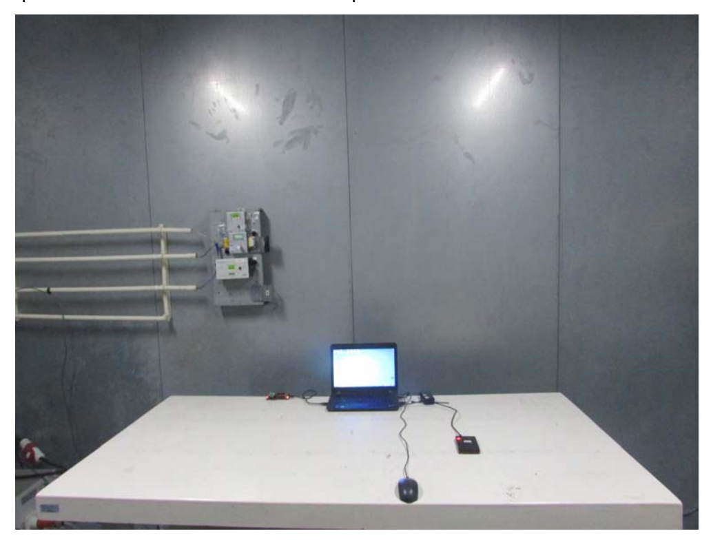
Description: Radiated Emission Test Setup for Below 1GHz

Description: Conducted Emission Test Setup for 150KHz-30MHz