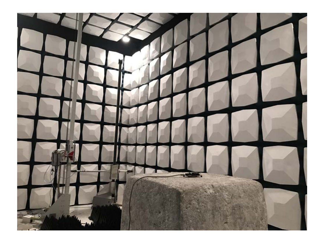
Description: Radiated Emission Test Setup for Above 18GHz