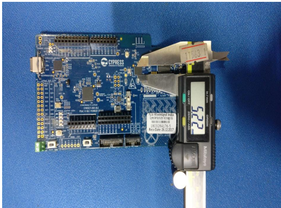
Dimensional view of radio