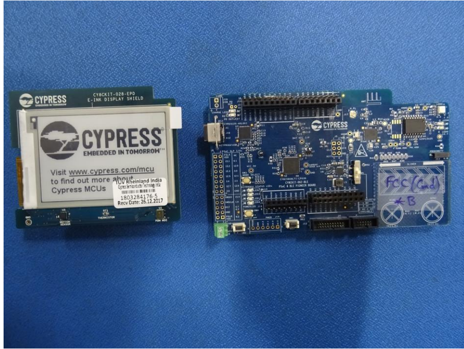
EUT with Display Removed