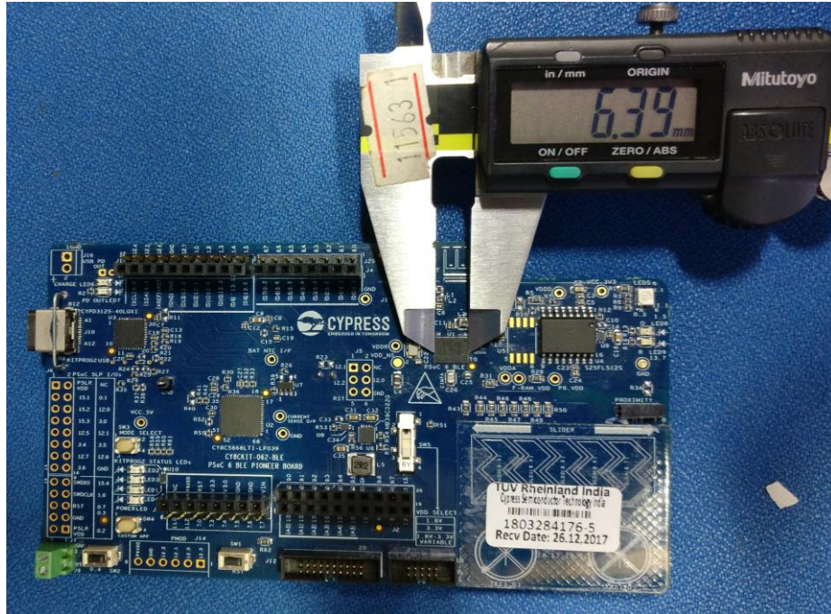
Dimensional view of radio