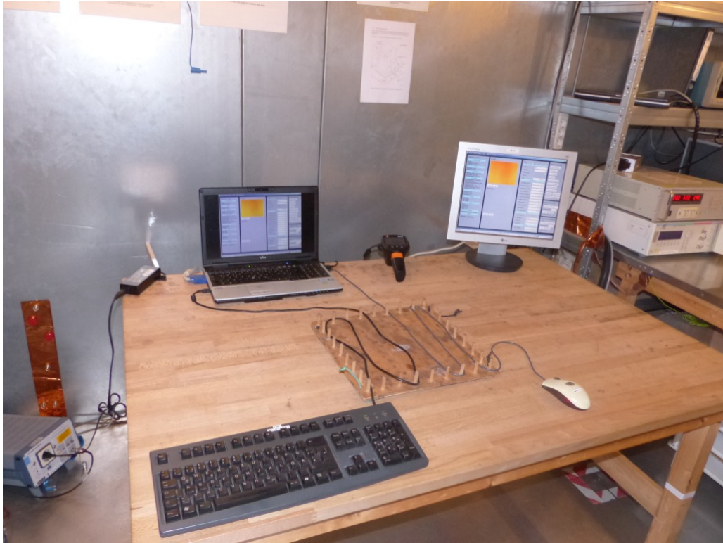
Photo 3: Test setup for conducted measurements (AC/DC adapter, 120 V/60 Hz, EMC insulated room, unintentional radiator, § 15)