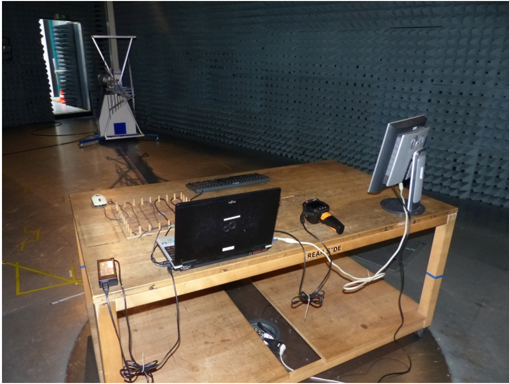
Photo 1: Test setup for radiated measurements (Enclosure, semi-anechoic chamber, 30 MHz to 1 GHz, unintentional radiator §15)