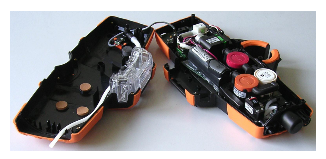
t330i,upper and lower shell