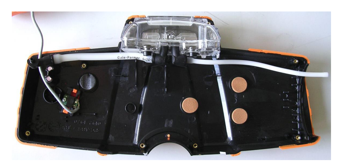
t330i, upper shell, view inside