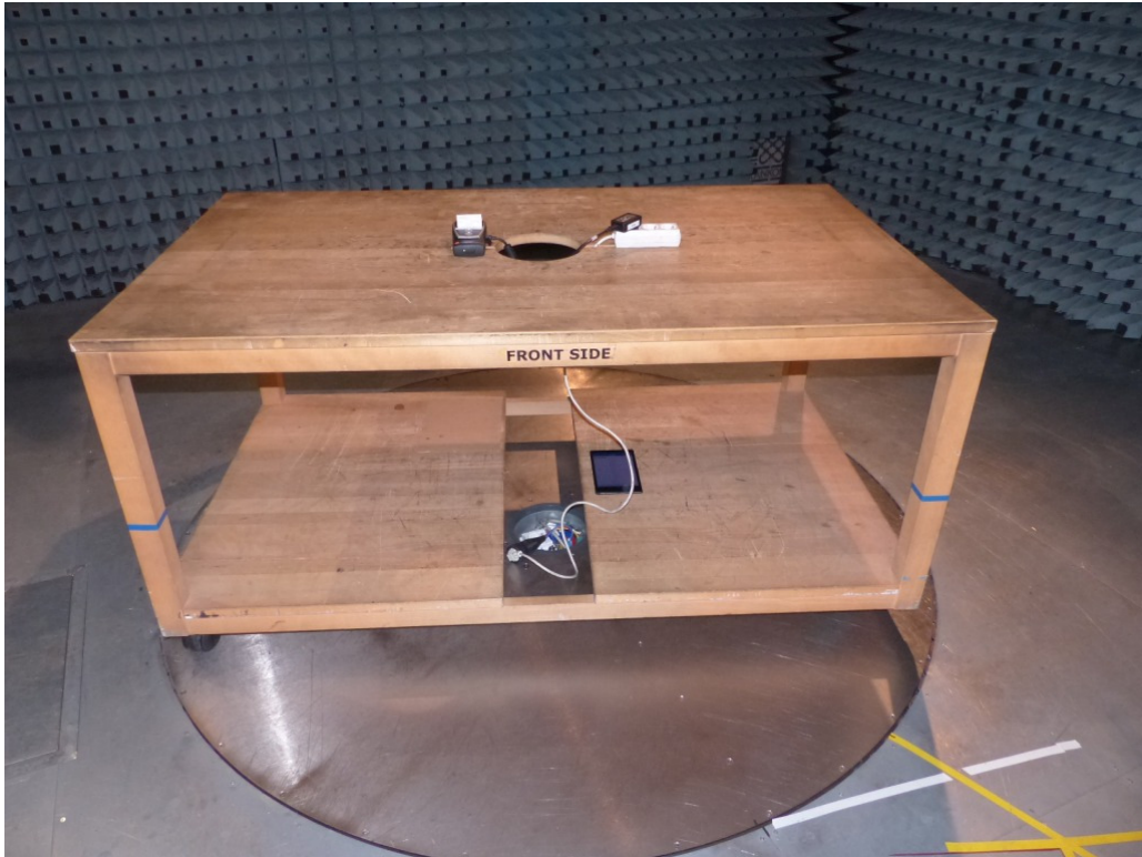
Photo 2: Test setup for radiated measurements detailed view (Enclosure, semi-anechoic chamber, 30 MHz to 1 GHz, intentional radiator §15)