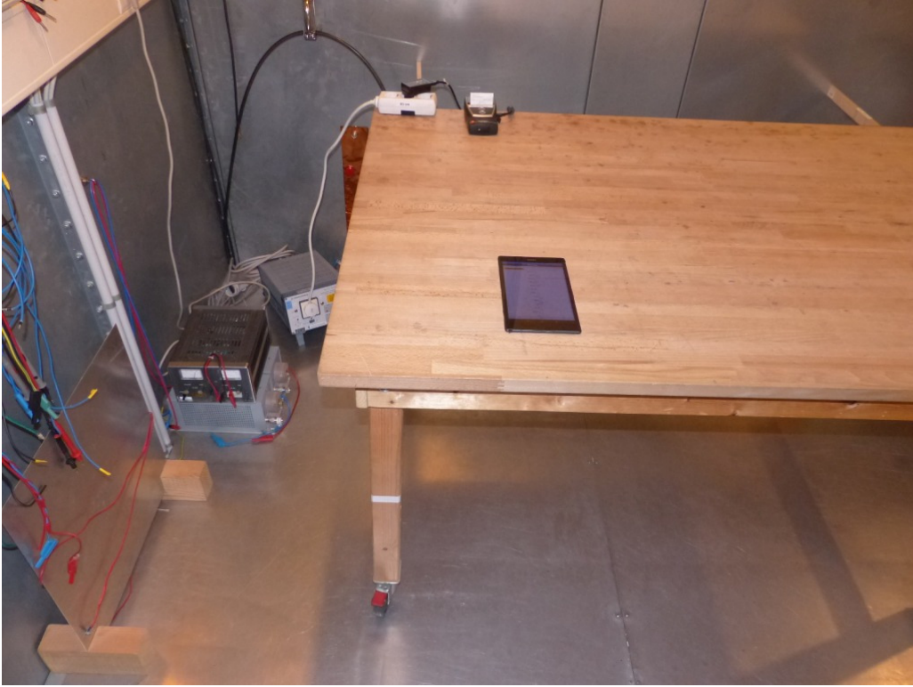
Photo 3: Test setup for conducted measurements (AC/DC adapter, 120 V/60 Hz, EMC insulated room, unintentional radiator, § 15)