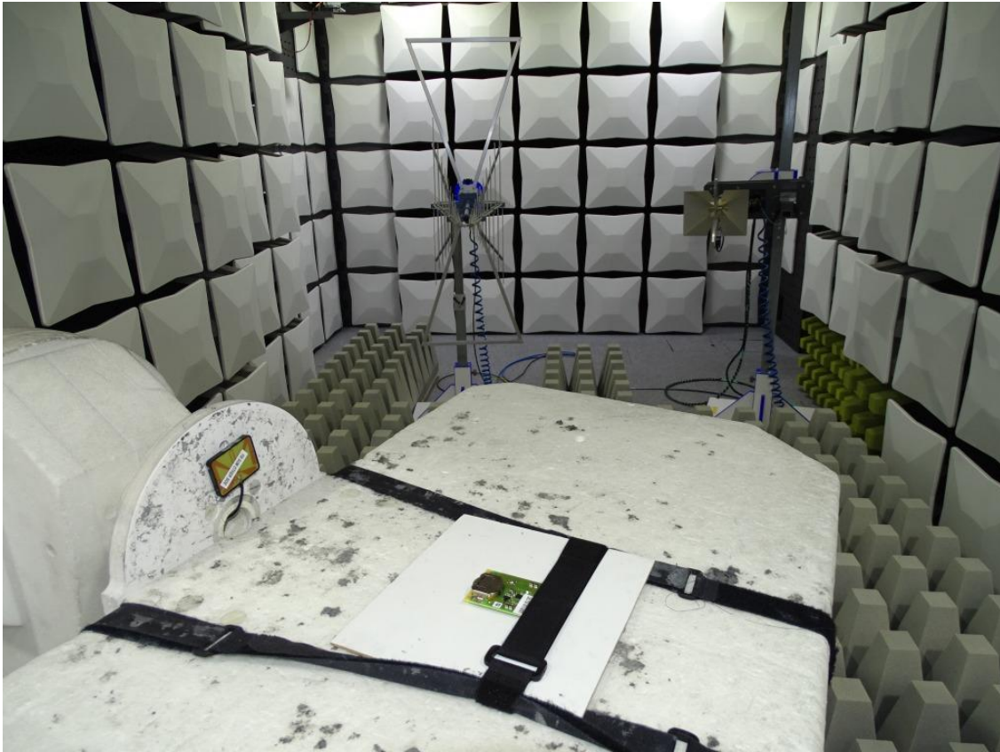
Photo 2: Test setup for radiated measurements (stand alone, EUT supplied by a battery) Above 1 GHz