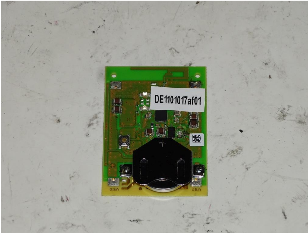
Photo 4: EUT 0572 2801 detailed view