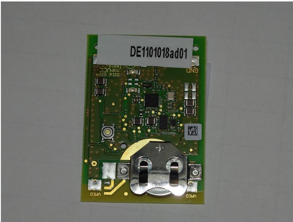
Photo 5: EUT 0572 2800 detailed view