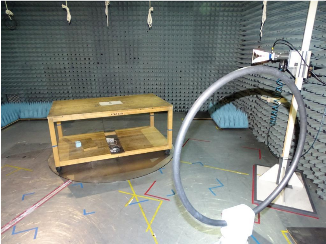
Photo 1: Test setup for radiated measurements (stand-alone, EUT supplied by a battery) H-Field 9k -30 MHz