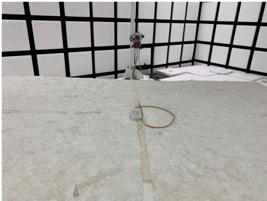
Radiated spurious emission Test Setup-2(Above 1GHz)