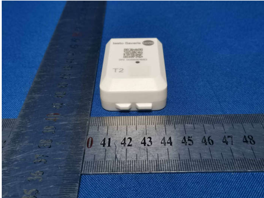
View of Product-3