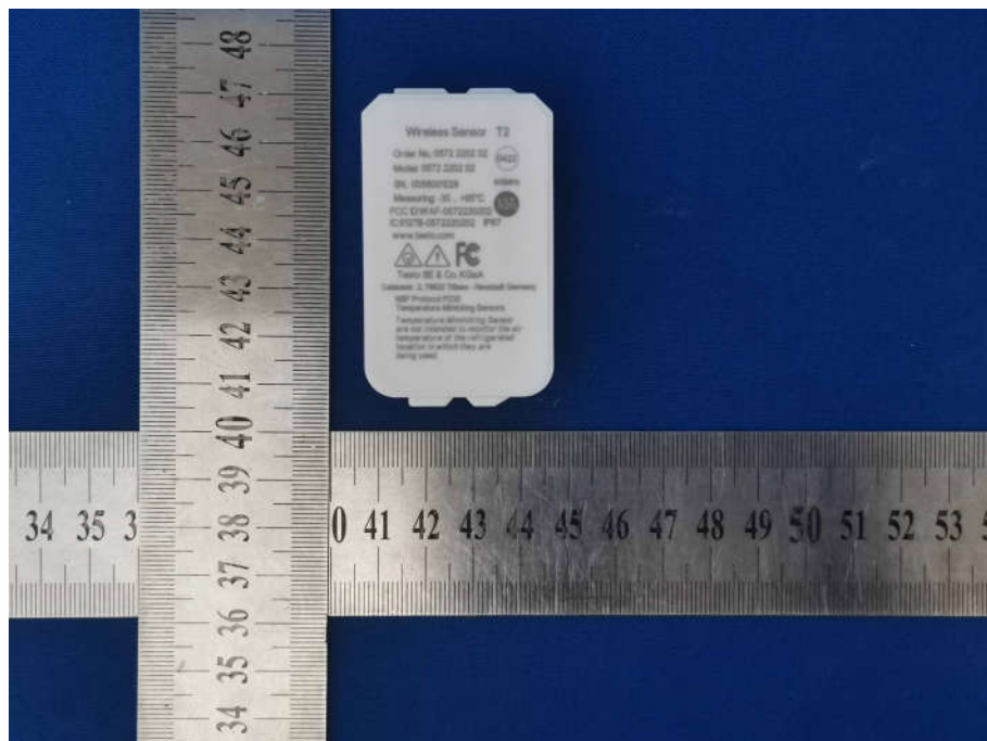
View of Product-2