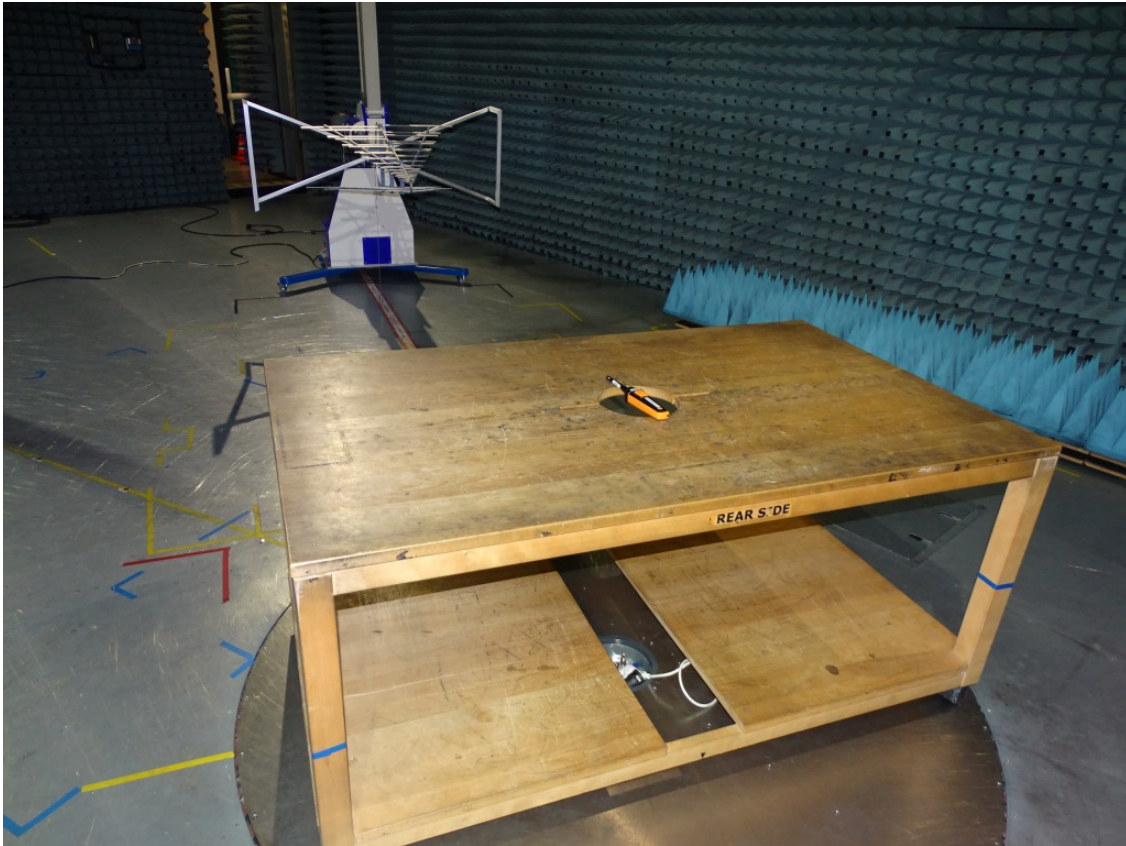
Photo 1: Test setup for radiated measurements (stand-alone, EUT supplied by a battery, unintentional radiator §15.109, ANSI C63.4) Below 1 GHz