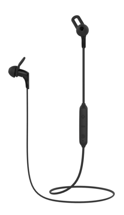
BTH135R Bluetooth stereo headset User's manual