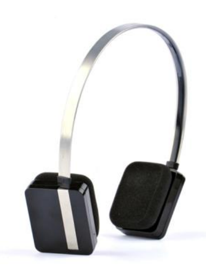
BTH059 Bluetooth stereo headset User's manual