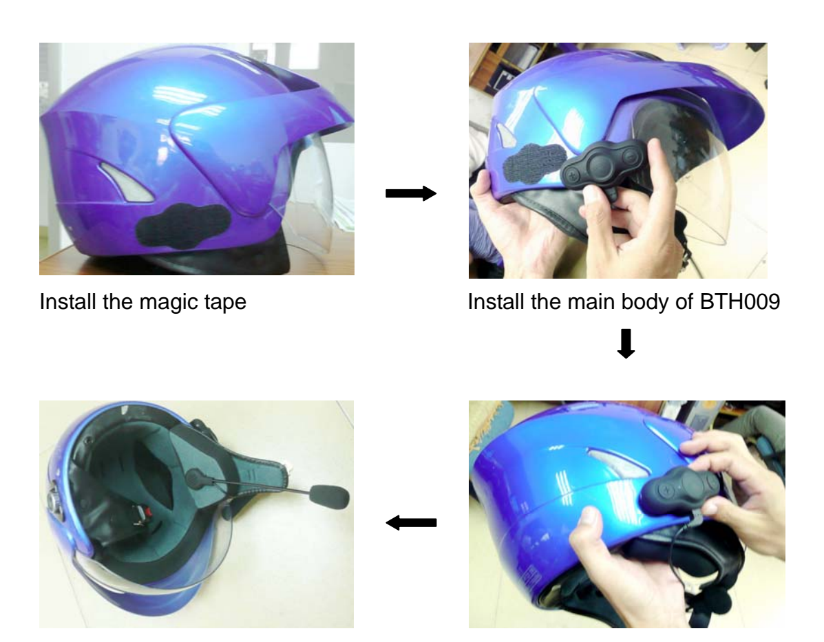
Install the loudspeaker of BTH009 BTH009