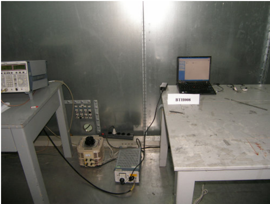
Photograph 1: Set-up for Conducted Emission