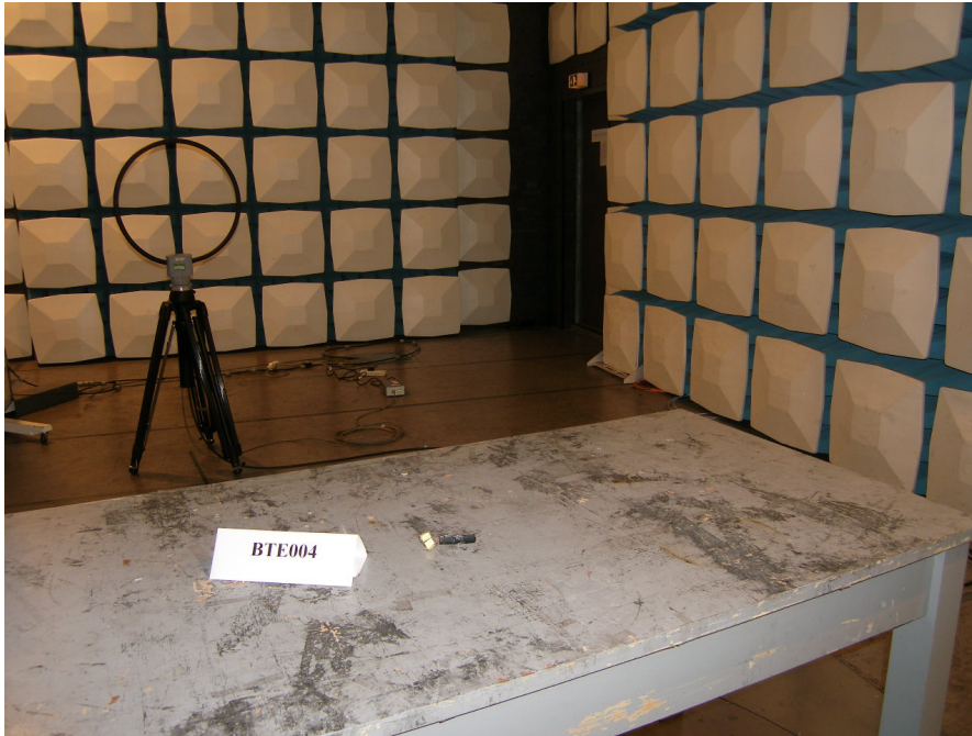
Photograph 1: Set-up for Radiation Measurement below 1GHz