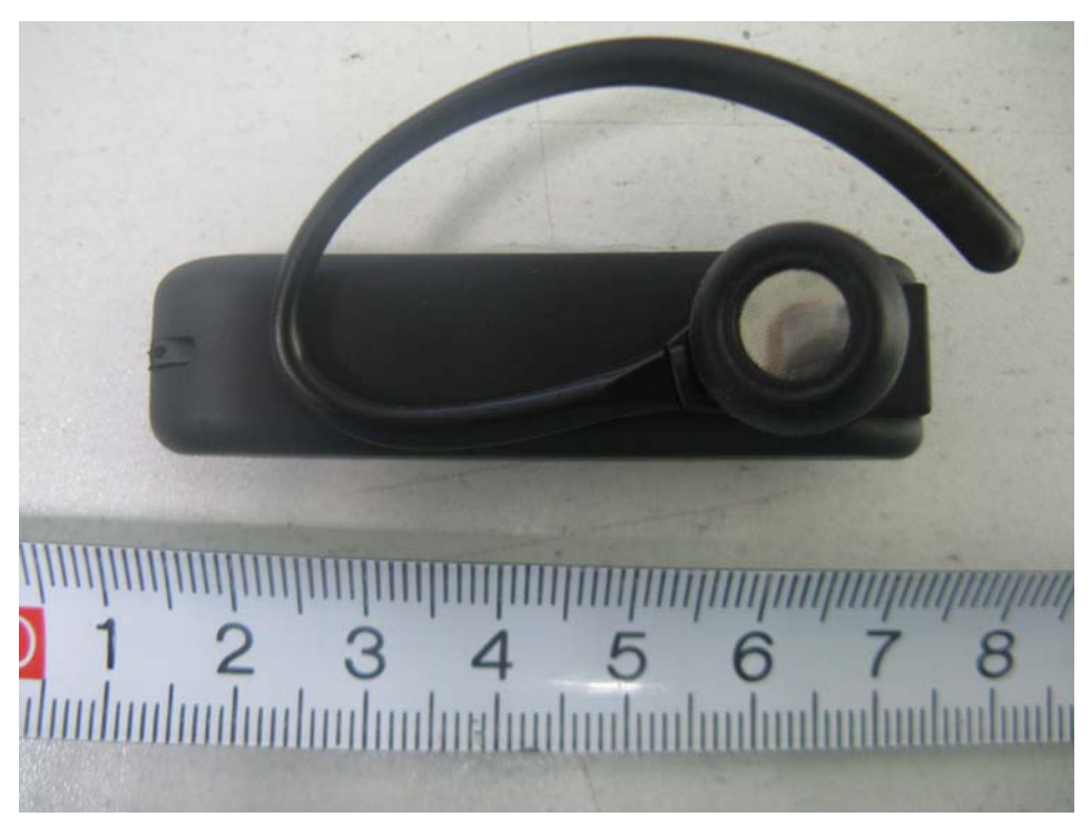
EUT – Side View