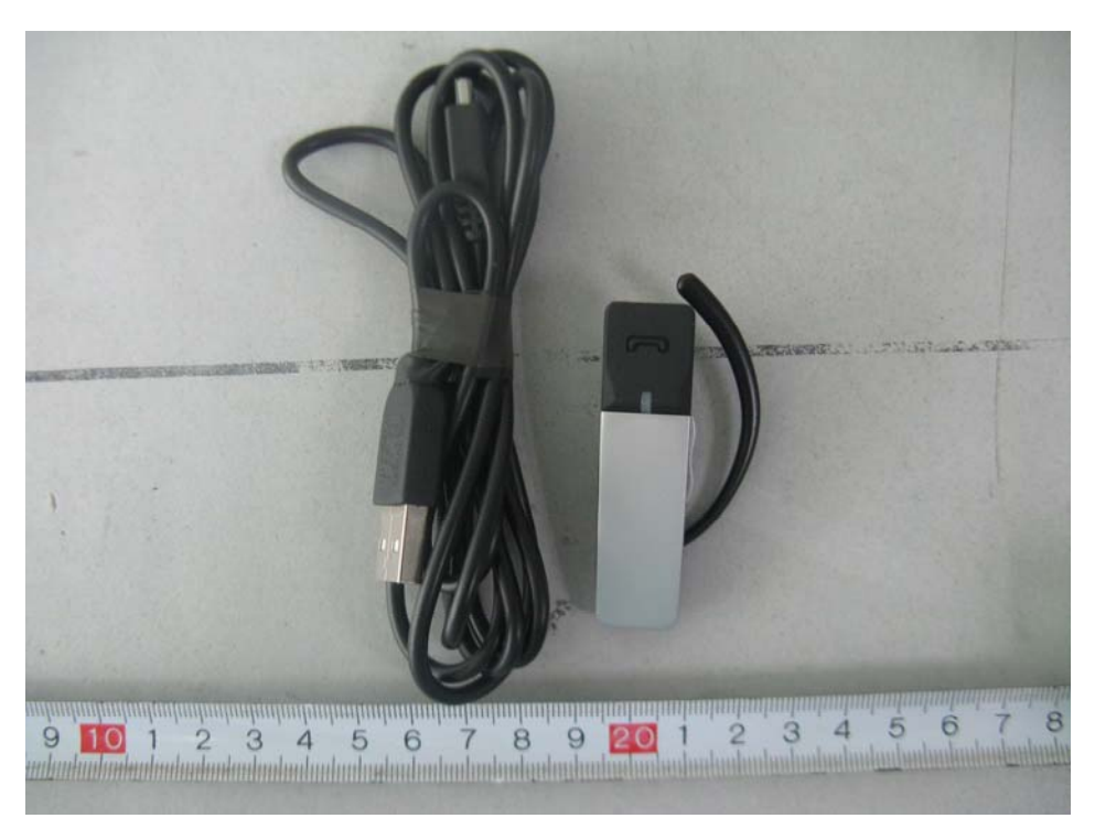
EUT – Front View