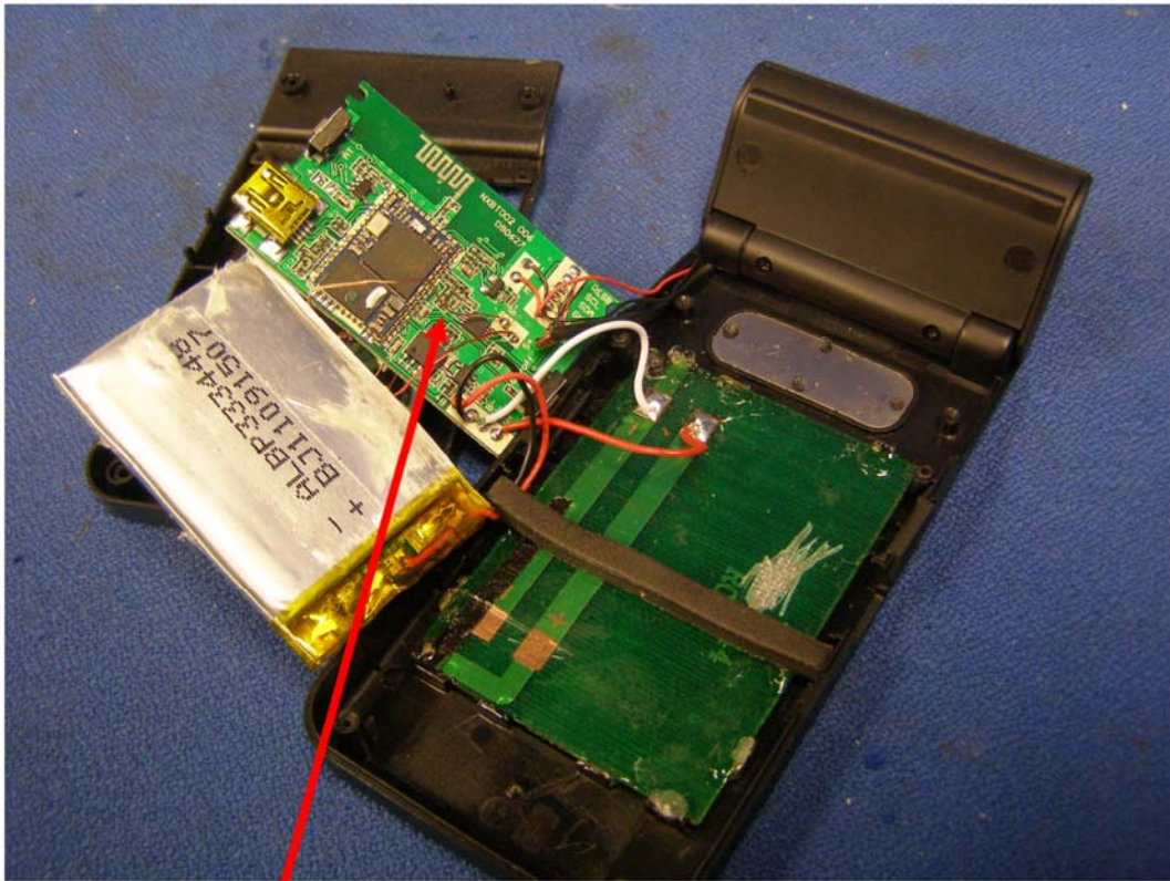
front side of 1# PCB