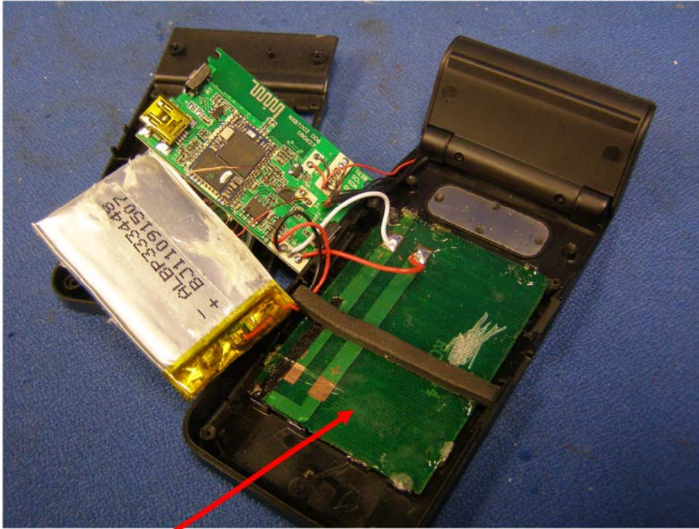
Front side of 2# PCB

No any circuit and component in back side of 2# PCB, back side just is the solar panel of enclosure