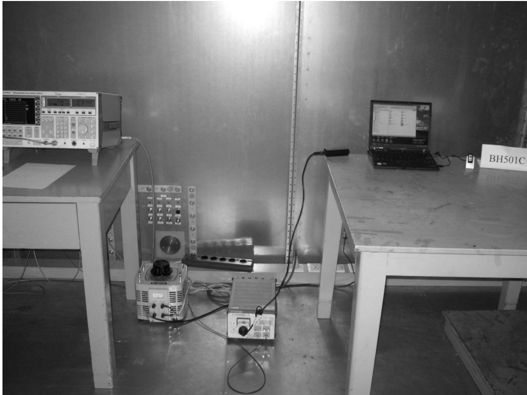
Photograph 1: Set-up for Conducted Emission