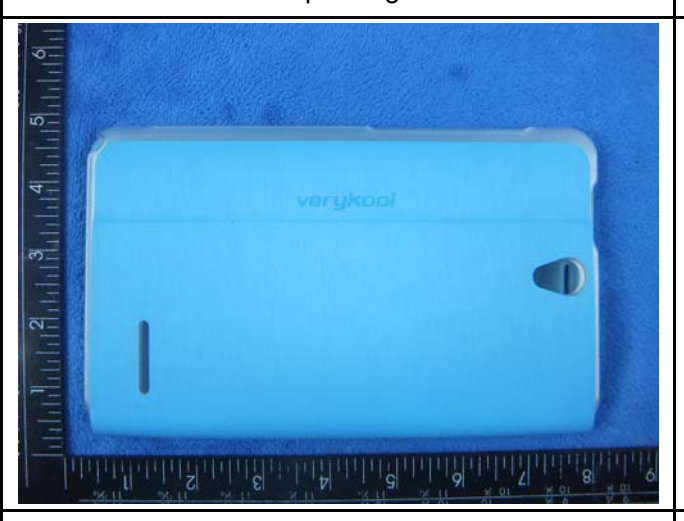
Cover Front View