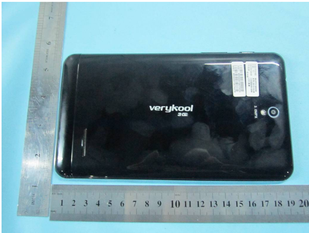
EUT - Rear View