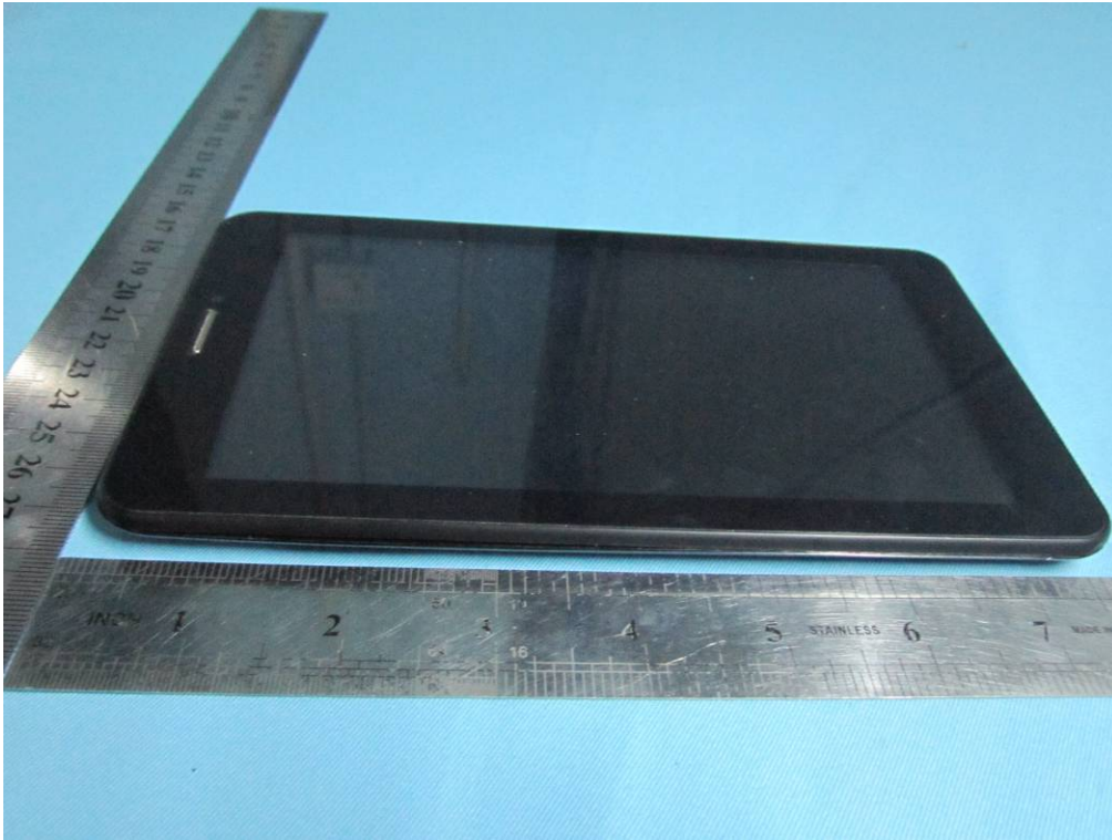
EUT - Left View

Report No.: 13070493-FCC-E Issue Date: November 21, 2013 Page: 22 of 36 www.siemic.com.cn