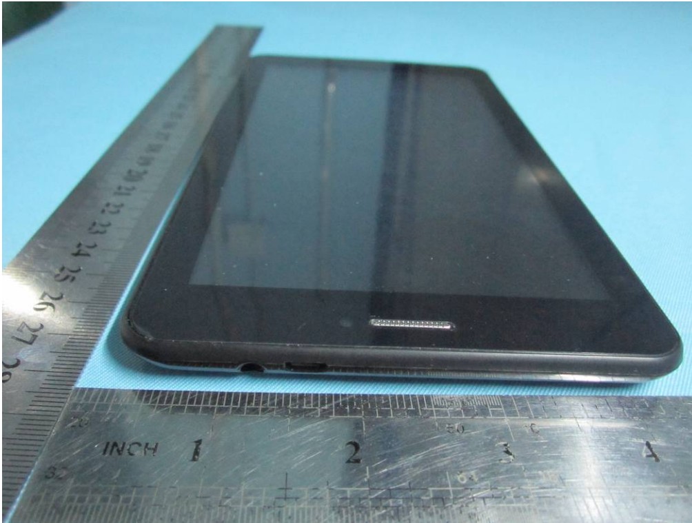
EUT - Top View

Report No.: 13070493-FCC-E Issue Date: November 21, 2013 Page: 21 of 36 www.siemic.com.cn