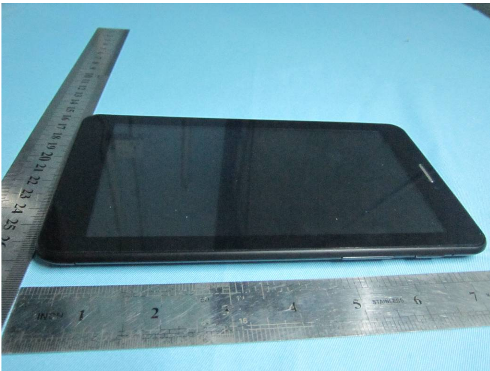
EUT - Right View