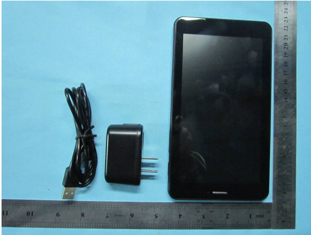
Whole Package - Top View