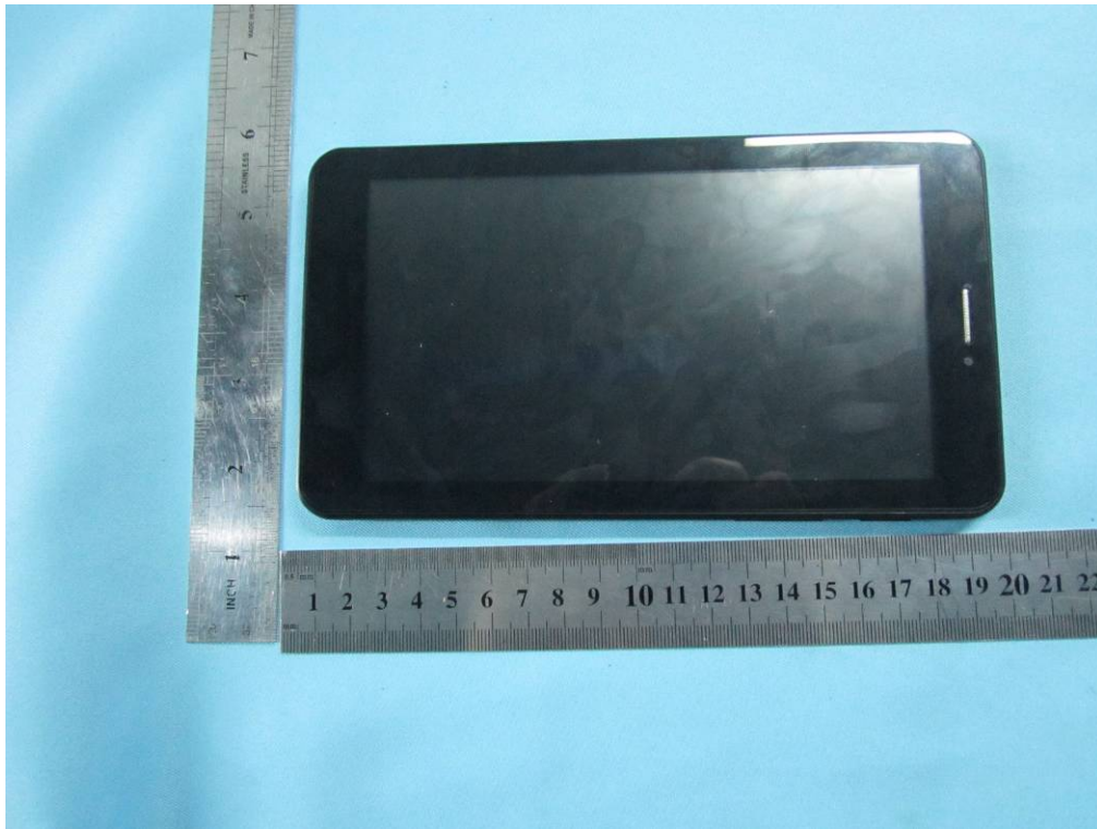
EUT - Front View

Report No.: 13070493-FCC-E Issue Date: November 21, 2013 Page: 20 of 36 www.siemic.com.cn