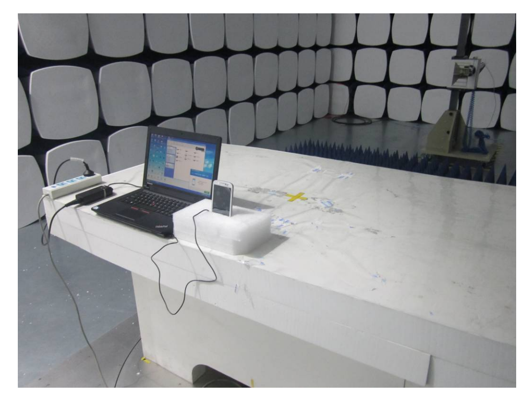
Radiated Spurious Emissions Test Setup Above 1GHz -Front View