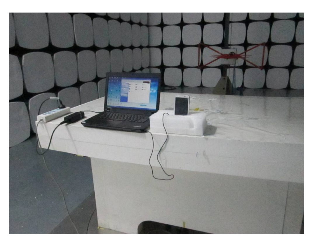
Radiated Spurious Emissions Test Setup Below 1GHz - Front View

Report No.: 14070215-FCC-E1 Issue Date: August 01, 2014 Page: 30 of 36 www.siemic.com