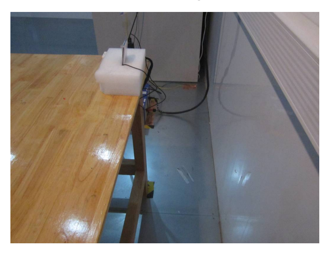
Conducted Emissions Test Setup Side View