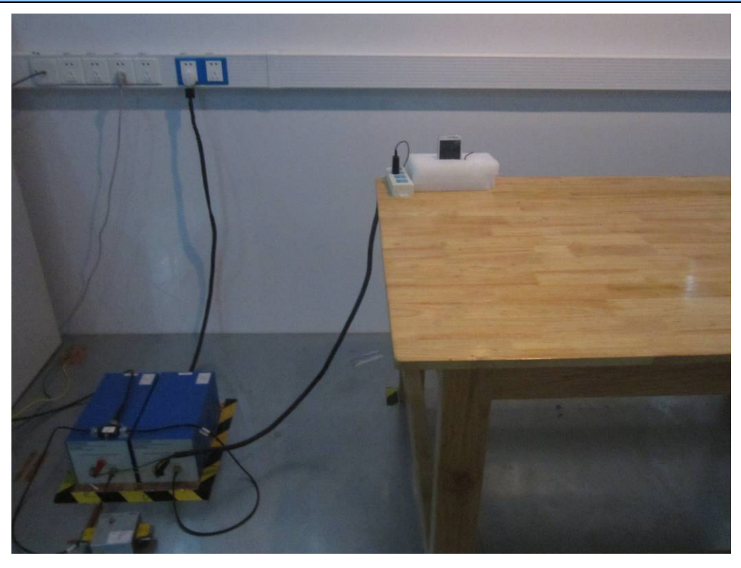
Conducted Emissions Test Setup Front View