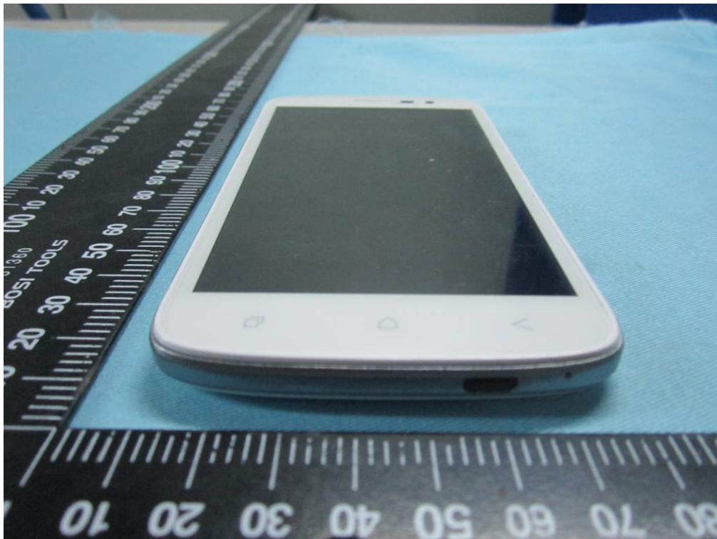
EUT - Bottom View