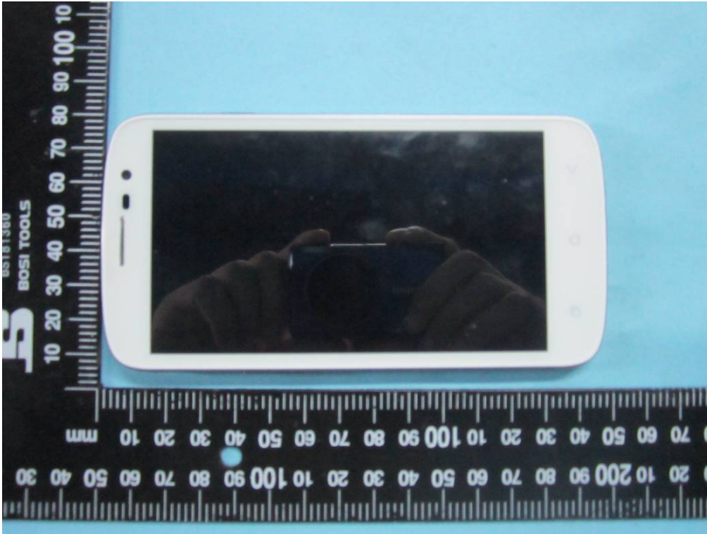
EUT - Front View

Report No.: 14070215-FCC-E1 Issue Date: August 01, 2014 Page: 20 of 36 www.siemic.com www.siemic.com.cn