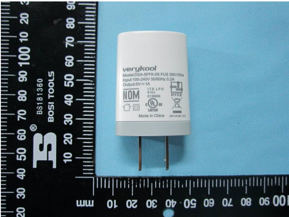
Adapter – Front View