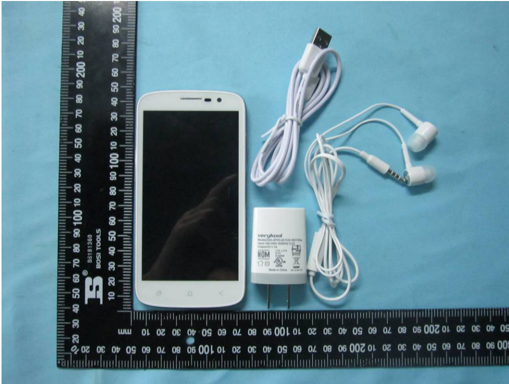
Whole Package - Top View