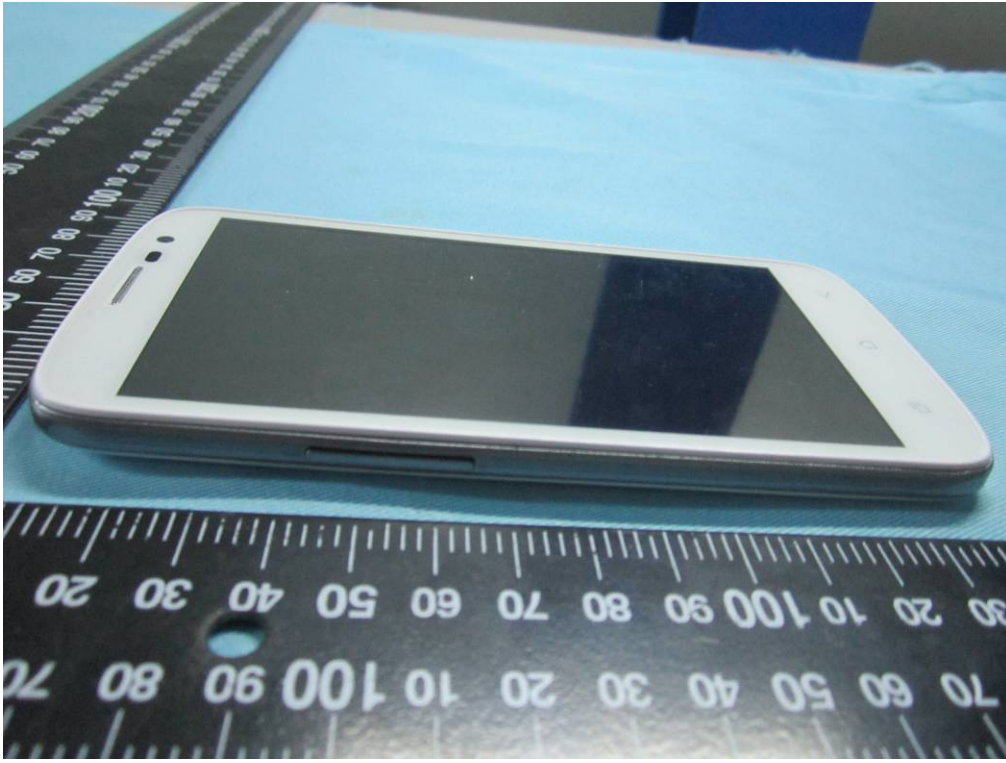
EUT - Left View

Report No.: 14070215-FCC-E1 Issue Date: August 01, 2014 Page: 22 of 36 www.siemic.com www.siemic.com.cn