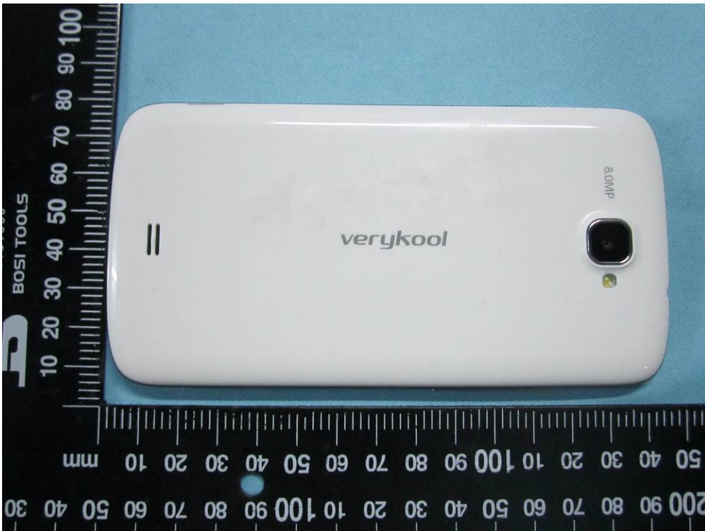
EUT - Rear View