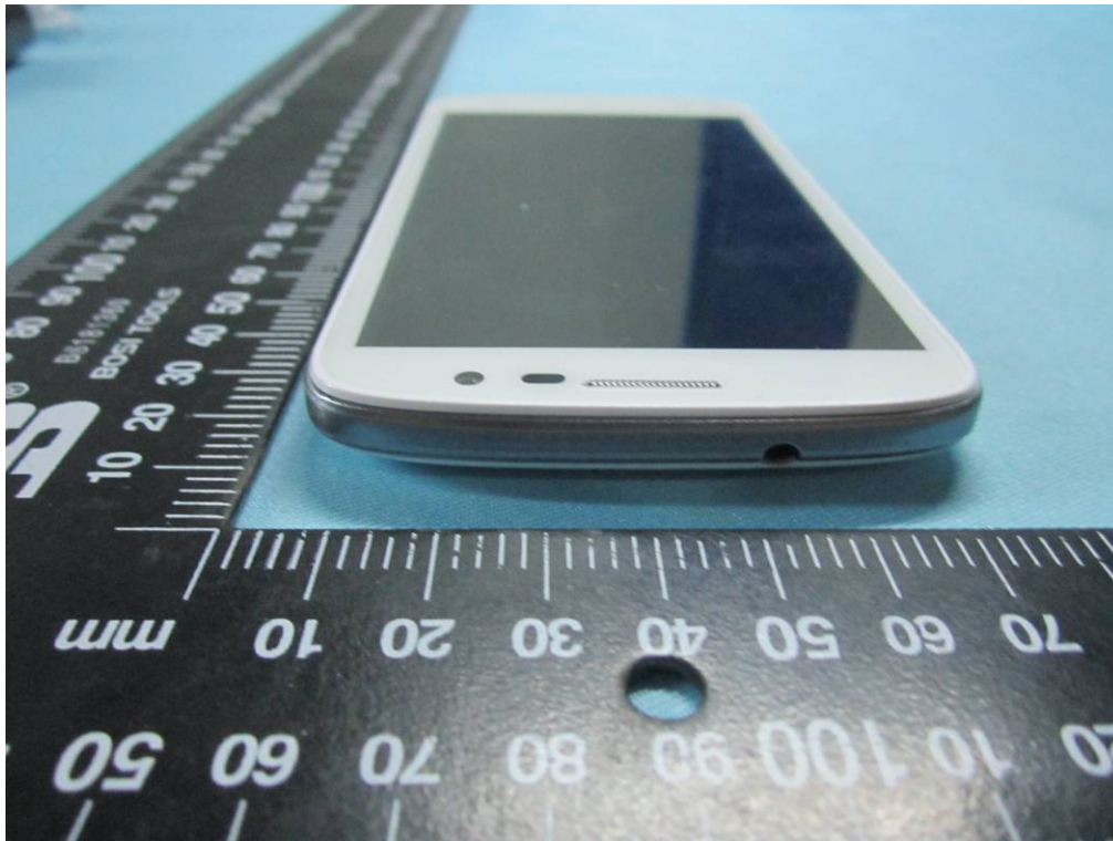
EUT - Top View

Report No.: 14070215-FCC-E1 Issue Date: August 01, 2014 Page: 21 of 36 www.siemic.com www.siemic.com.cn