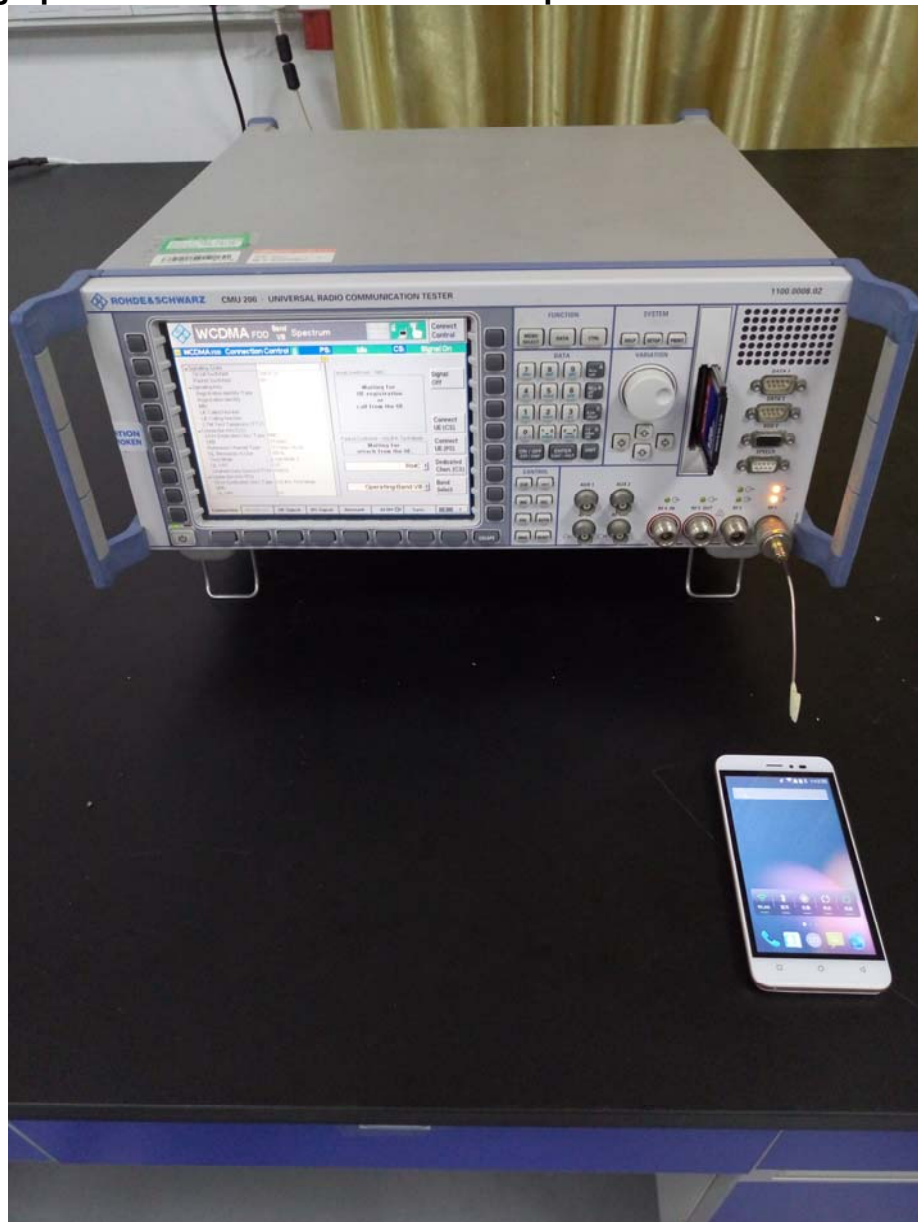
Photograph –2G&3G Conducted Test Setup