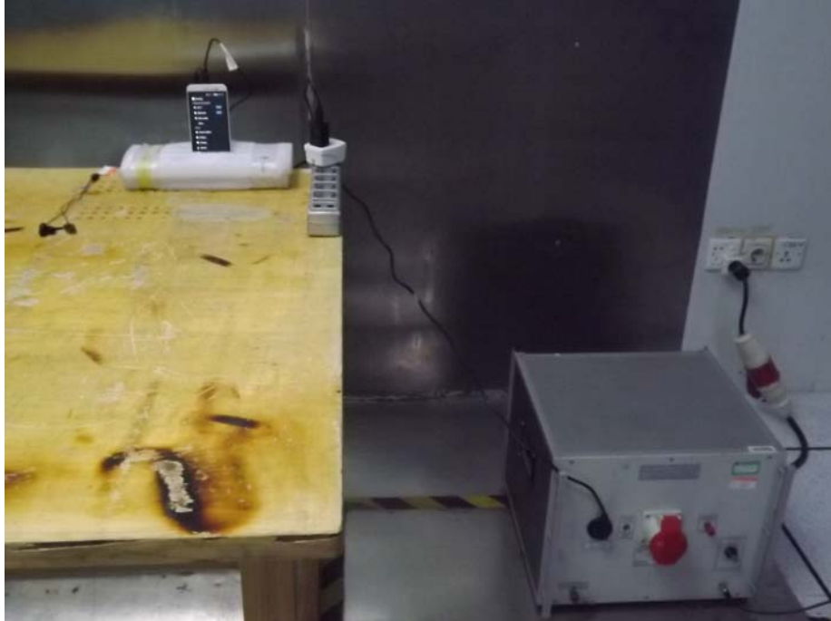
Test Site 1#