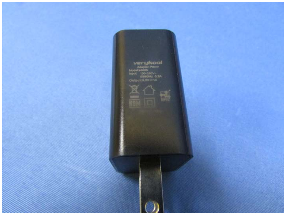
Adapter 1 Label