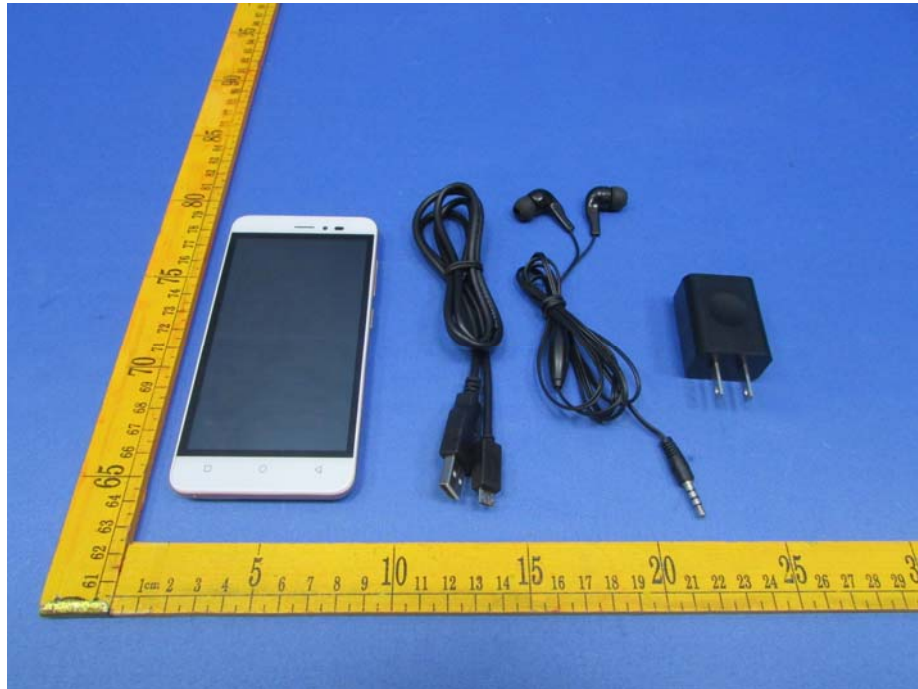
With Adapter 1