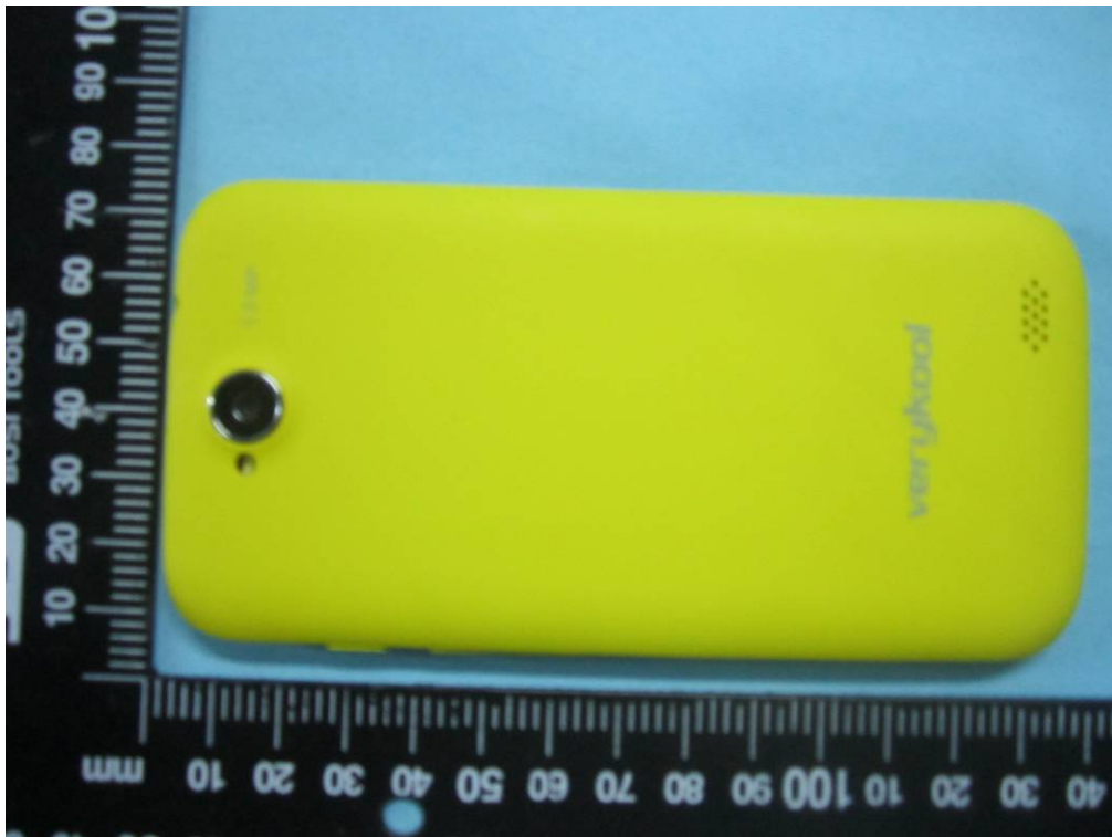
EUT - Rear View