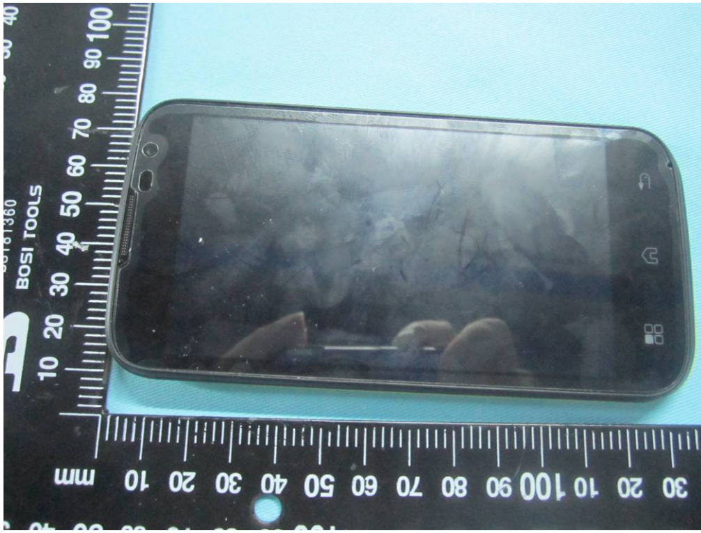
EUT - Front View

Report No.: 14070326-FCC-E1 Issue Date: July 18, 2014 Page: 20 of 36 www.siemic.com www.siemic.com.cn