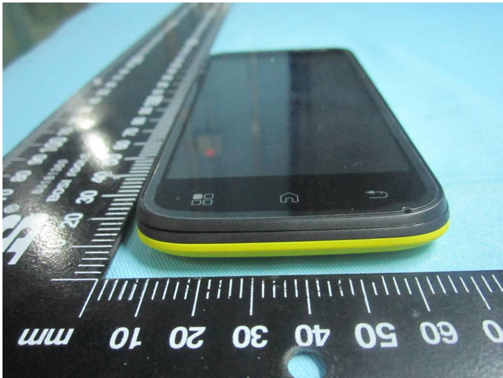
EUT - Bottom View