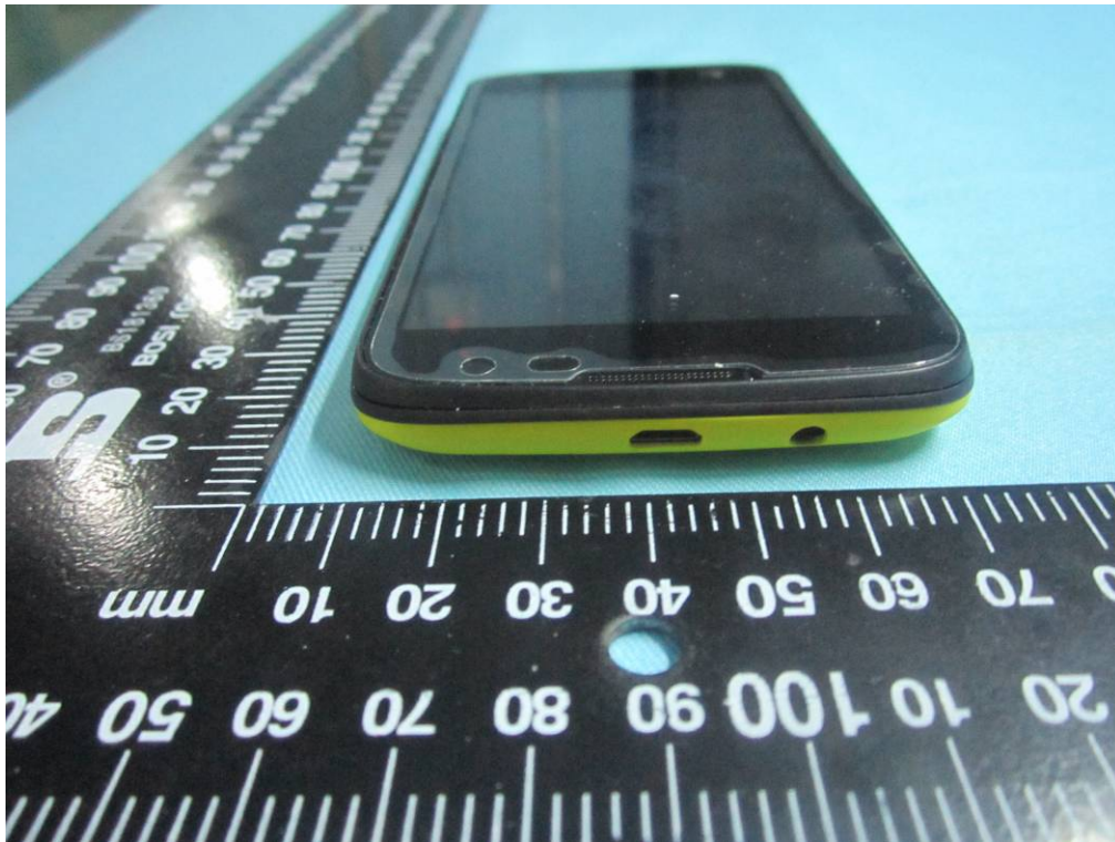
EUT - Top View

Report No.: 14070326-FCC-E1 Issue Date: July 18, 2014 Page: 21 of 36 www.siemic.com www.siemic.com.cn