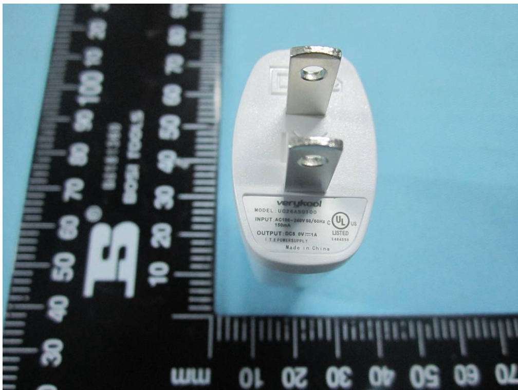
Adapter - Front View