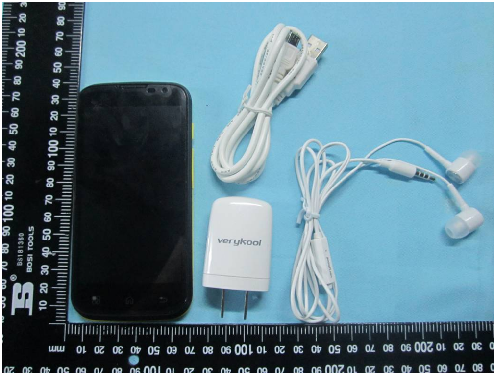
Whole Package - Top View