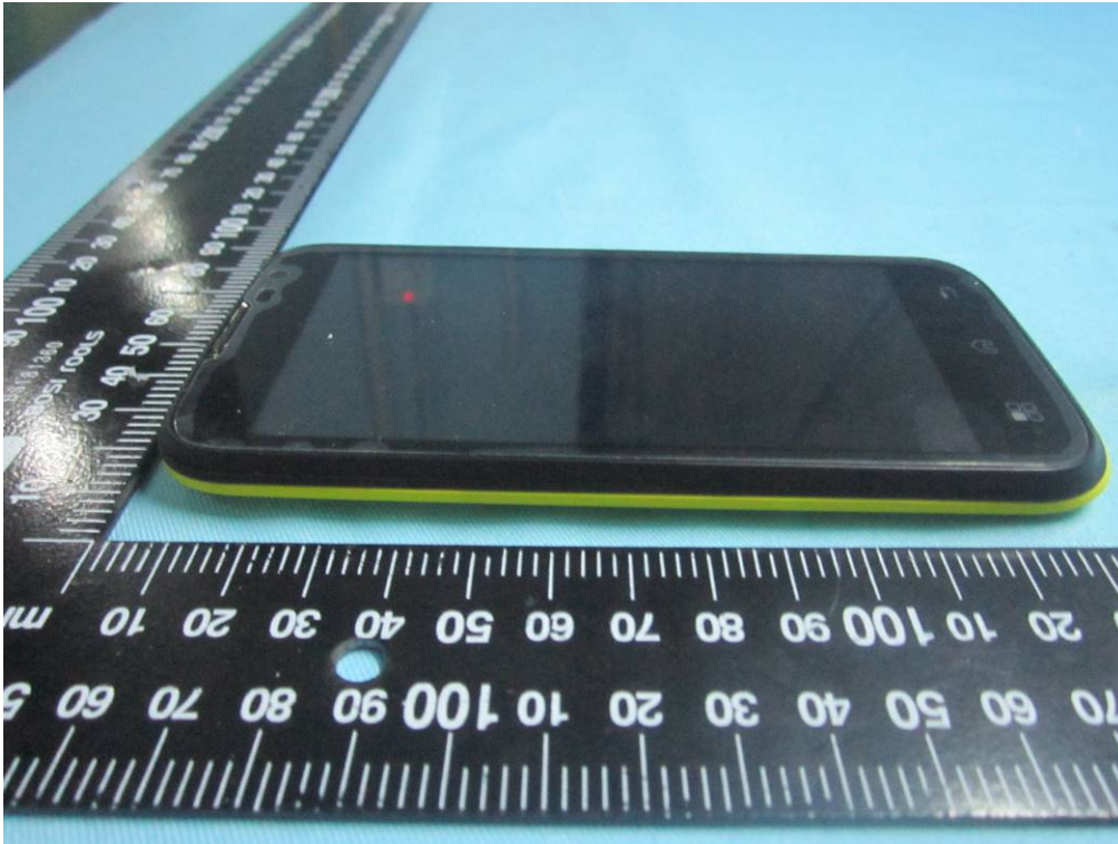
EUT - Left View

Report No.: 14070326-FCC-E1 Issue Date: July 18, 2014 Page: 22 of 36 www.siemic.com www.siemic.com.cn