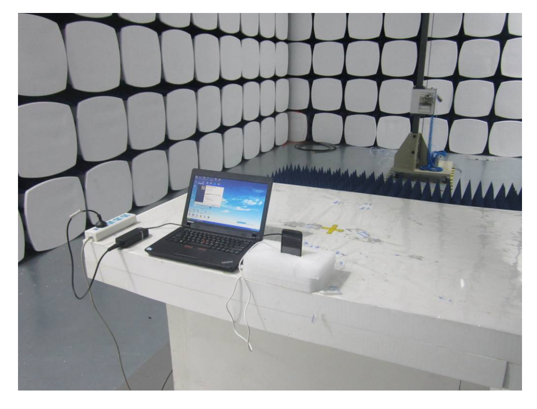
Radiated Spurious Emissions Test Setup Above 1GHz -Front View