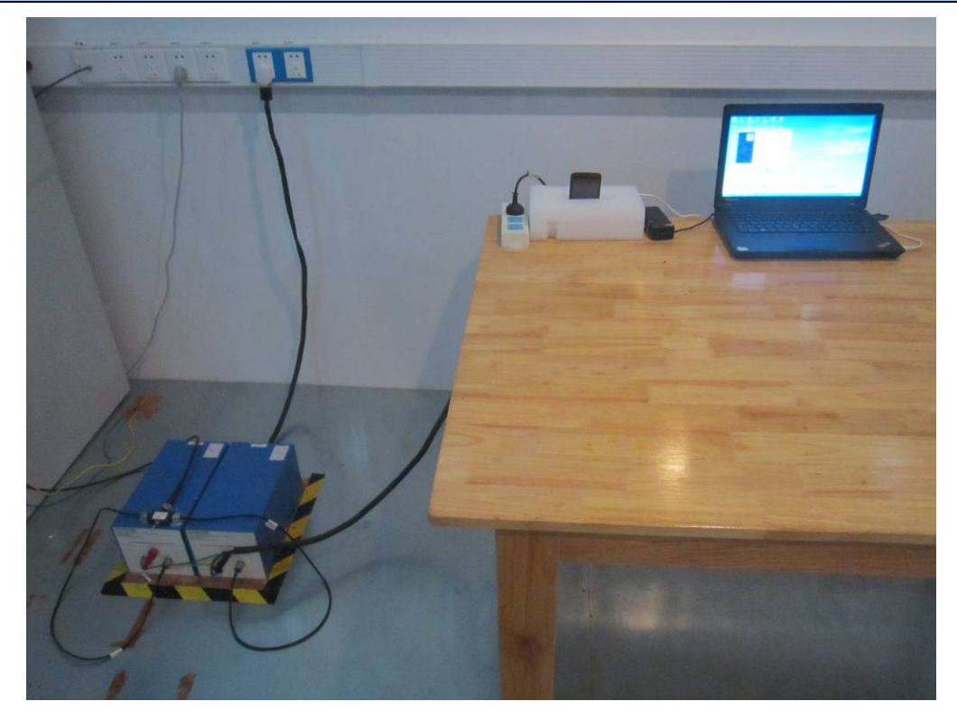
Conducted Emissions Test Setup Front View