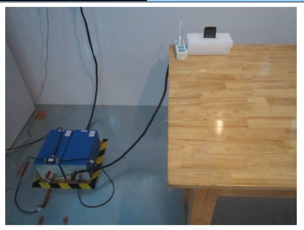
Conducted Emissions Test Setup Front View