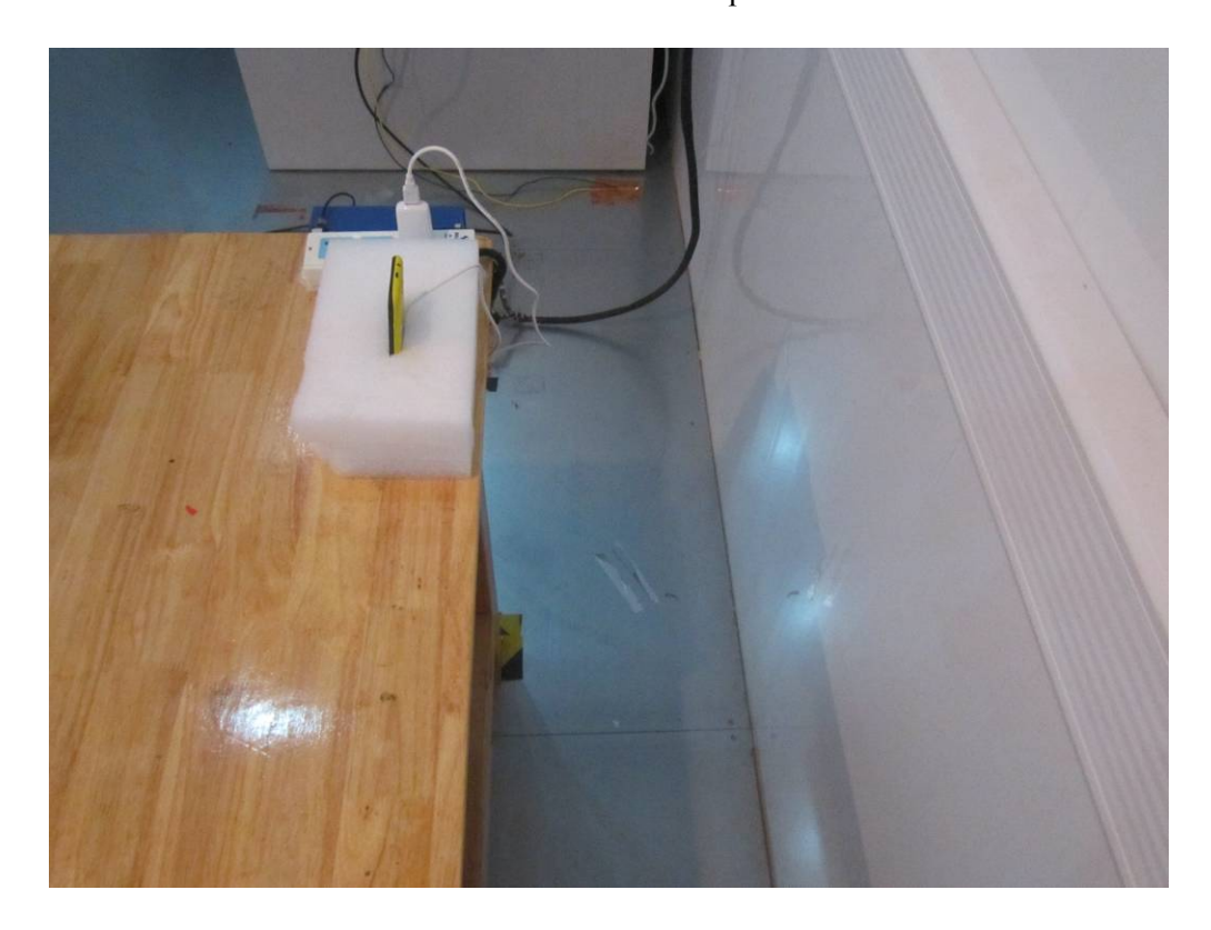
Conducted Emissions Test Setup Side View