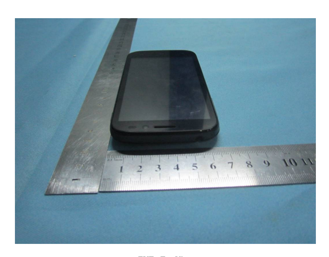
EUT - Top View

Report No.: 13070615-FCC-E1 Issue Date: January 17, 2014 Page: 21 of 34 www.siemic.com.ci