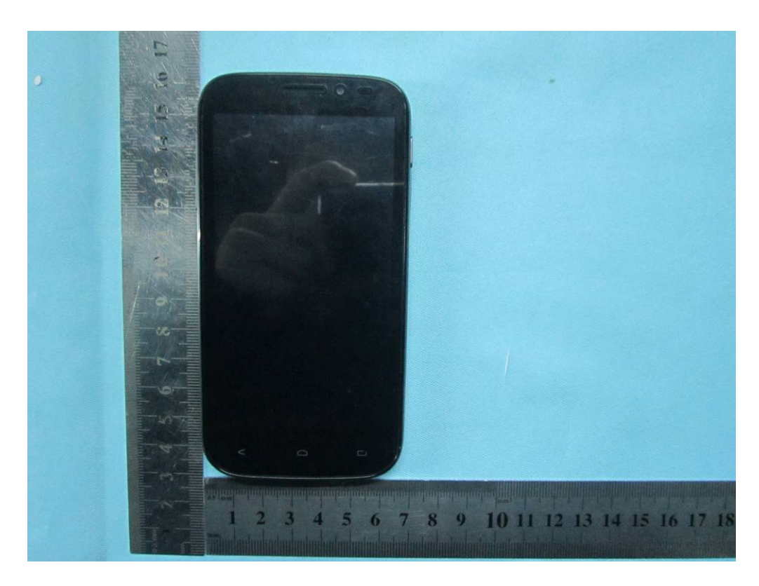
UT - Front View

Report No.: 13070615-FCC-E1 Issue Date: January 17, 2014 Page: 20 of 34