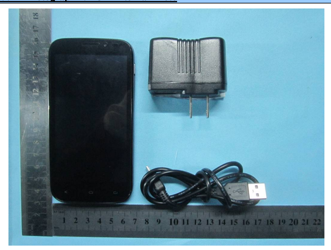
Whole Package - Top View