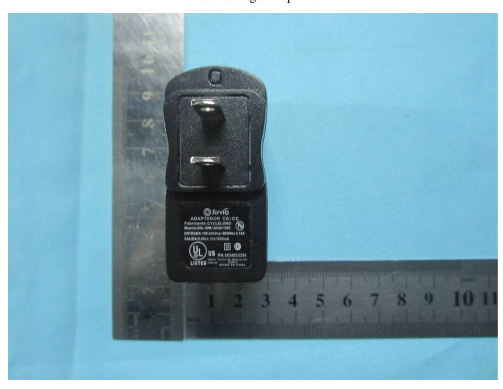
Adapter - Top View