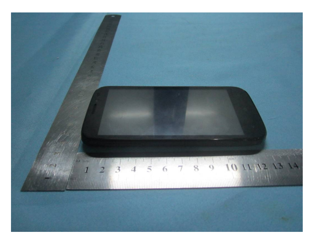
EUT - Left View

Report No.: 13070615-FCC-E1 Issue Date: January 17, 2014 Page: 22 of 34 www.siemic.com.ci