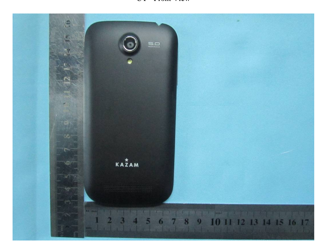
EUT - Rear View