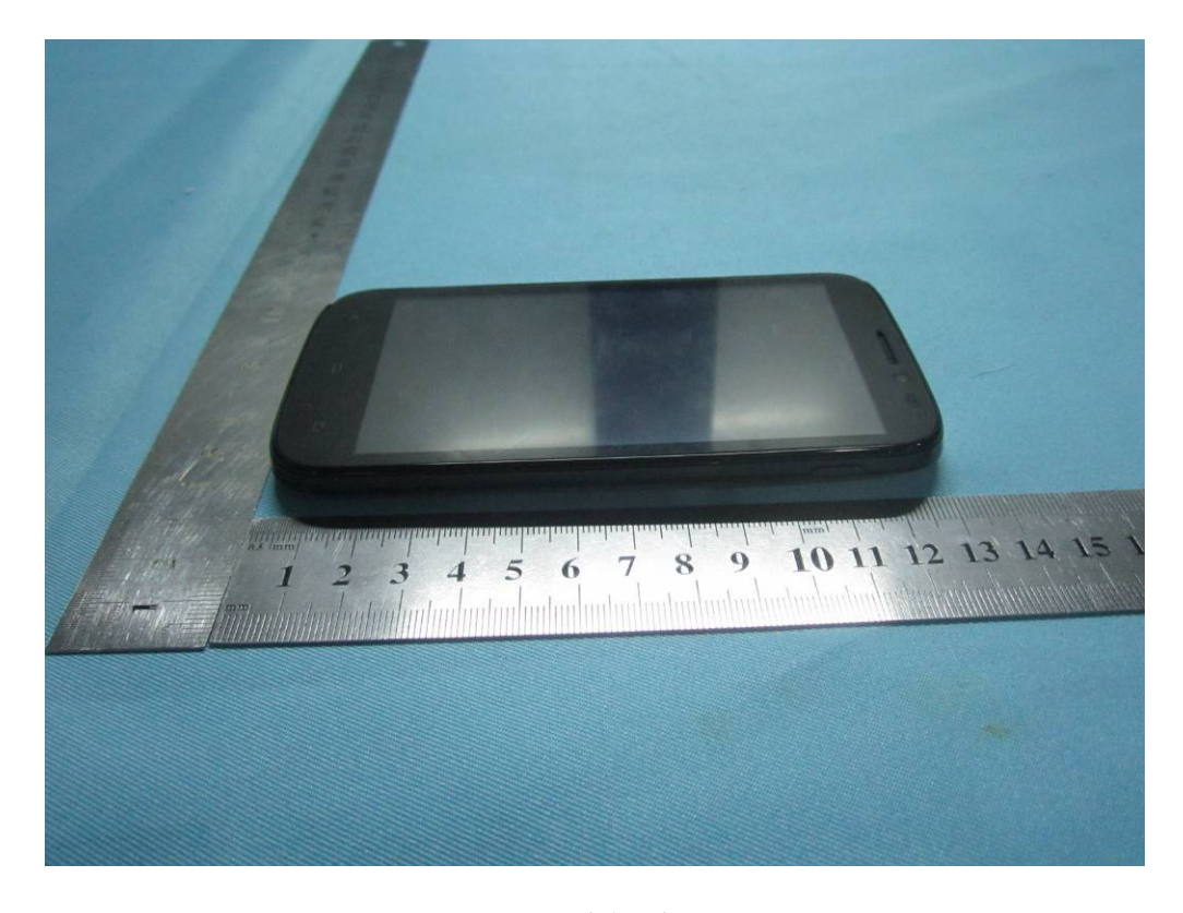
EUT - Right View