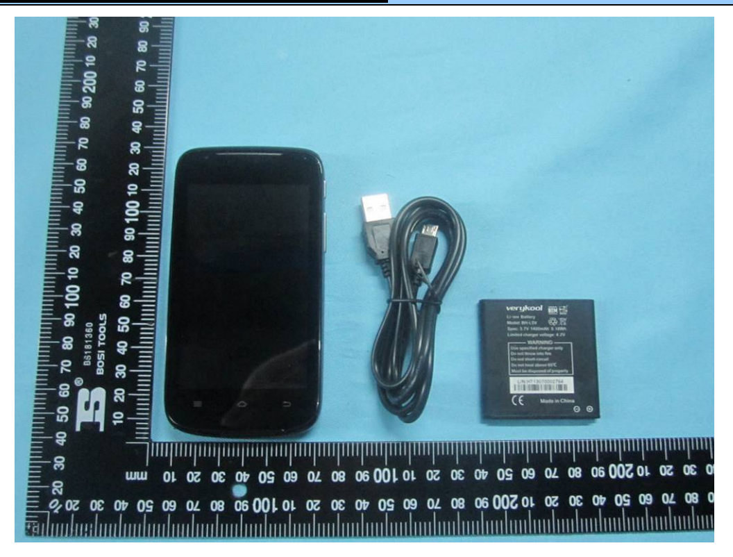
Whole Package - Top View