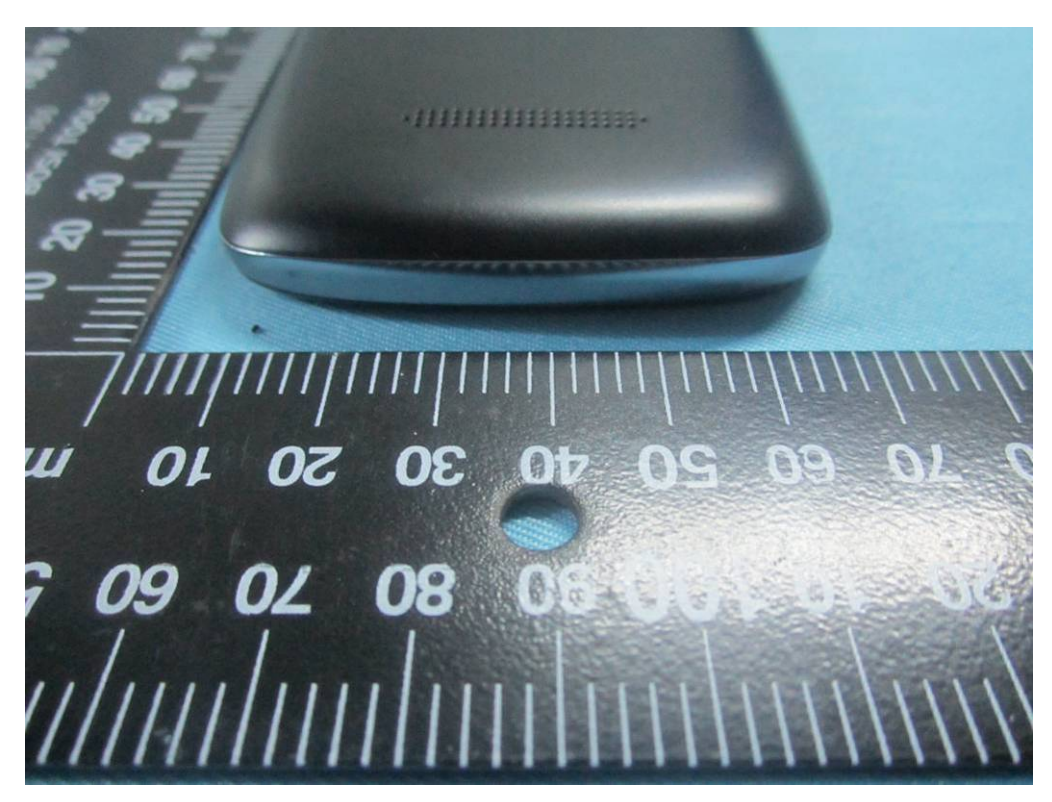
EUT - Bottom View