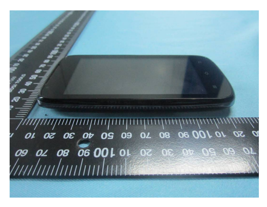
EUT - Left View

Report No.: 14070039-FCC-E Issue Date: March 05, 2014 Page: 22 of 37