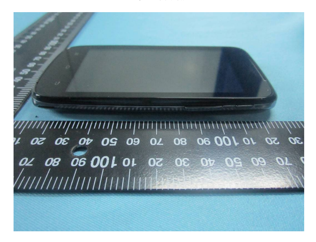
EUT - Right View