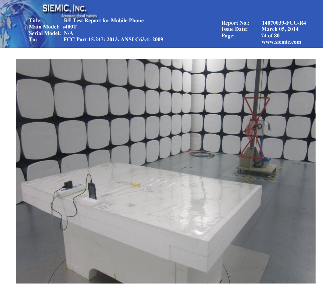
Radiated Spurious Emissions Test Setup Below 1GHz - Front View