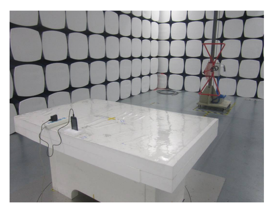
Radiated Spurious Emissions Test Setup Below 1GHz - Front View

Report No: 14070039-FCC-R2 Issue Date: March 05, 2014 Page: 77 of 83 www.siemic.com