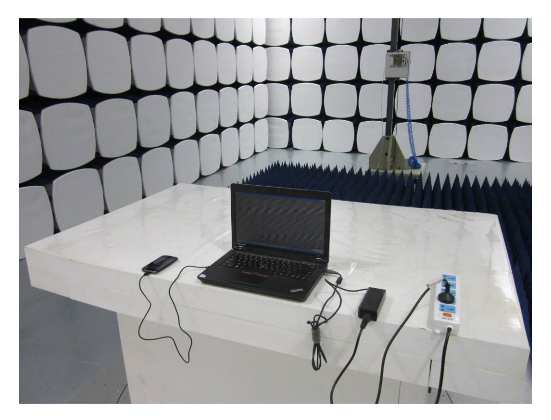
Radiated Spurious Emissions Test Setup Above 1GHz -Front View