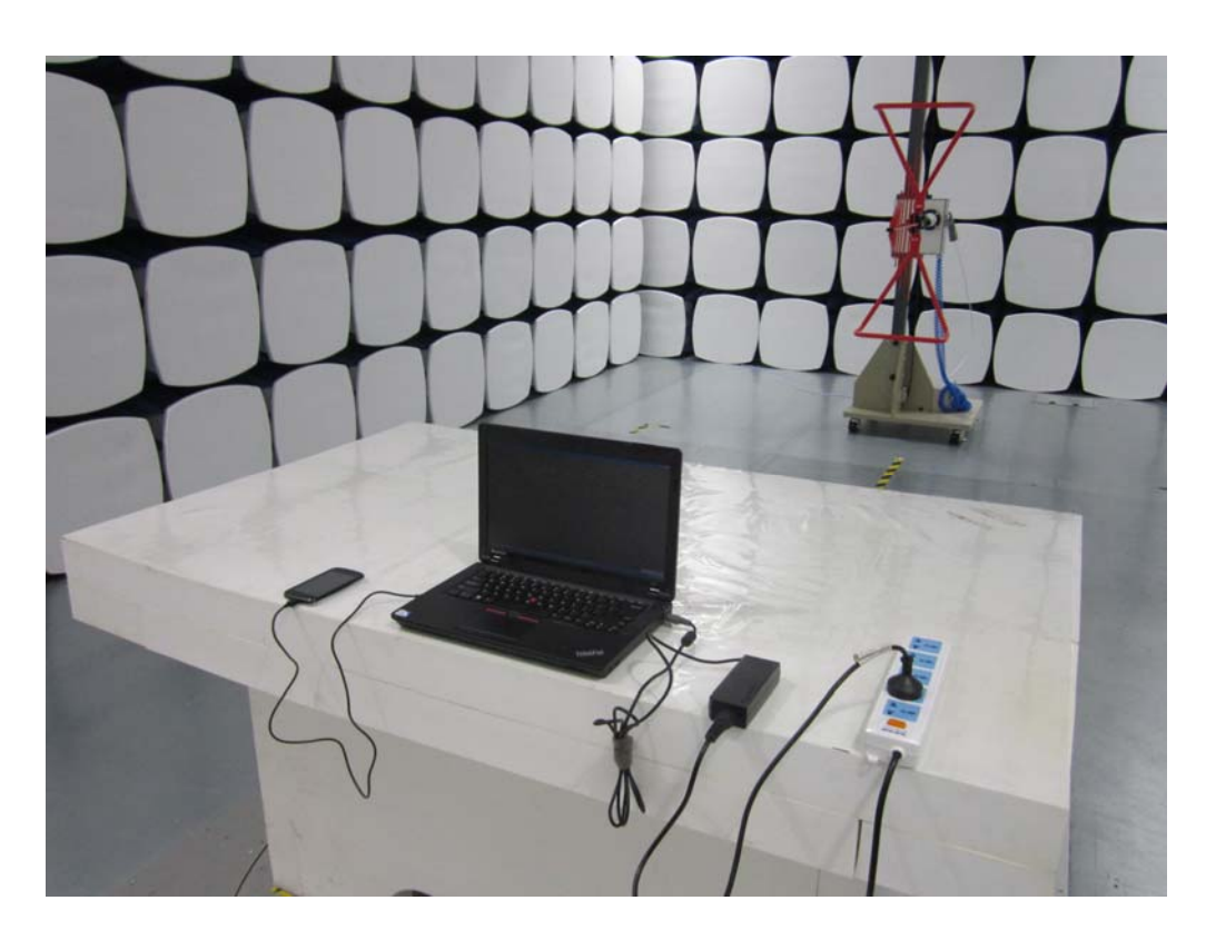
Radiated Spurious Emissions Test Setup Below 1GHz - Front View

Report No.: 13070137-FCC-E Issue Date: July 05, 2013 Page: 30 of 36