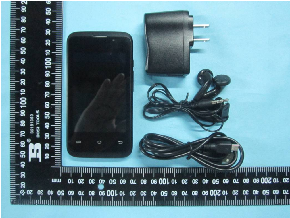
Whole Package - Top View