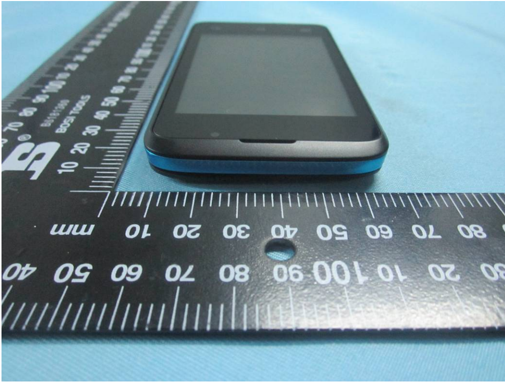
EUT - Top View

Report No.: 14070196-FCC-E1 Issue Date: May 09, 2014 Page: 21 of 36 www.siemic.com www.sinmic.com.cn