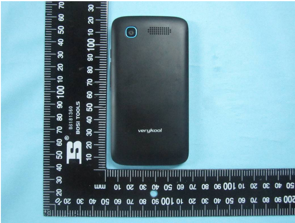
EUT - Rear View