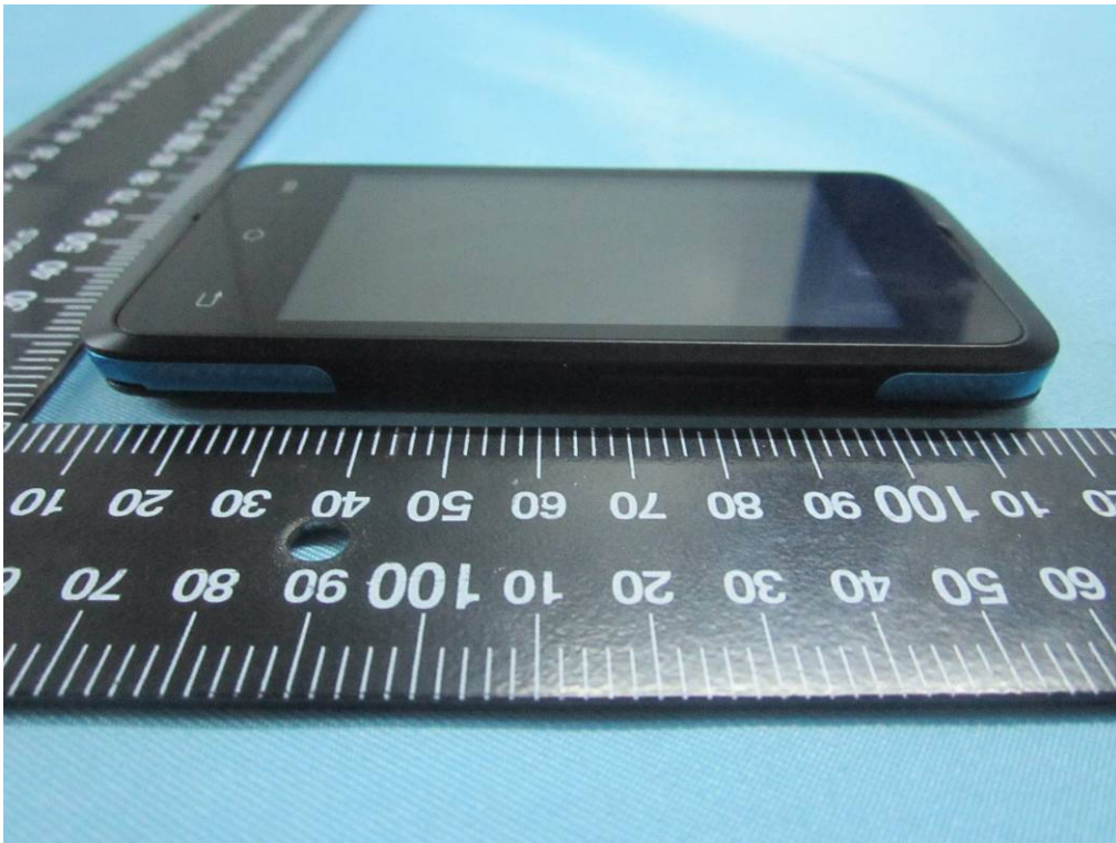
EUT - Right View