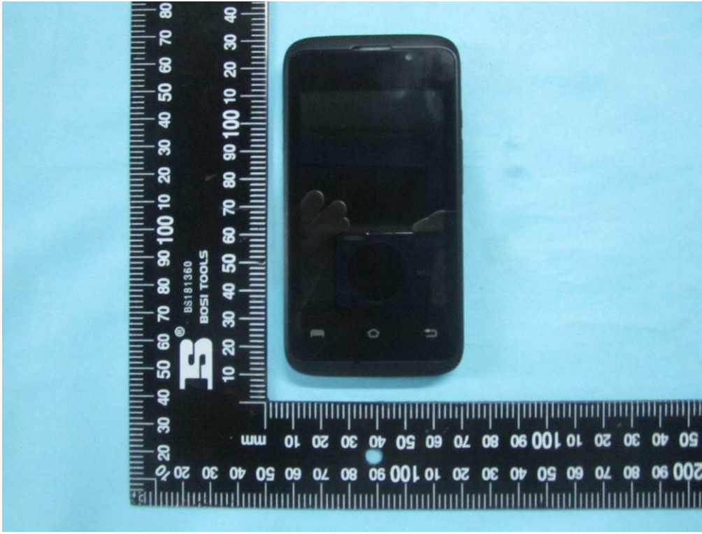
EUT - Front View

Report No.: 14070196-FCC-E1 Issue Date: May 09, 2014 Page: 20 of 36 www.siemic.com www.siemic.com.cn