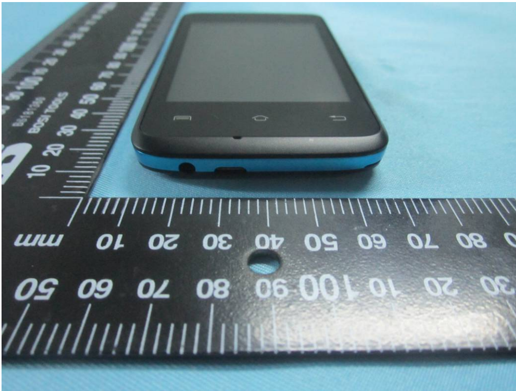
EUT - Bottom View